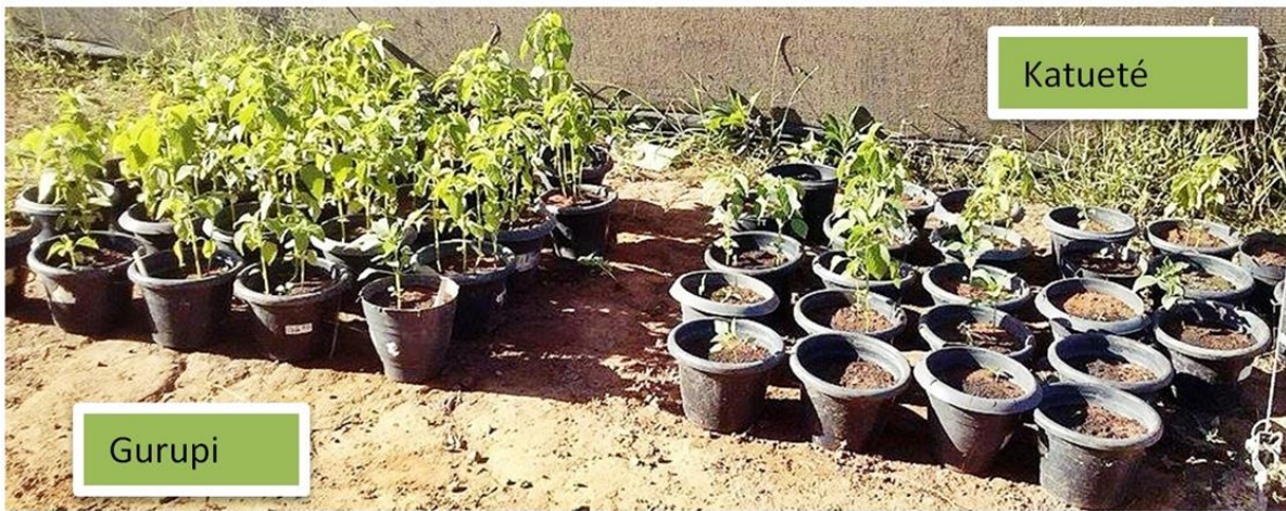
Figure 3: Transmission test on seeds of Salvia hispanica L. from two locations (Gurupi and Katueté).

According to [25], the species of Fusarium are commonly associated with the seeds of various crops, causing loss of germination and vigor, also assisting in complex pathogens that cause topples in plants. Symptoms caused by the fungus Colletotrichum spp. are irregular lesions with light brown to dark brown color accompanied by necrosis of the vein of the leaf. Seeds from the Katueté were subjected to inappropriate storage conditions, thus showing low germinating power seed (11%) can be viewed in Figure 4. Although 89% of the seeds did not germinate, no symptoms of any pathogen in seedlings that germinated and nor was there evidence that the seeds did not germinate. Comparing the two origins of the seeds as the physiological and sanitary quality, it was found that the seeds of Gurupi have better physiological quality and those of Katueté best sanitary quality.