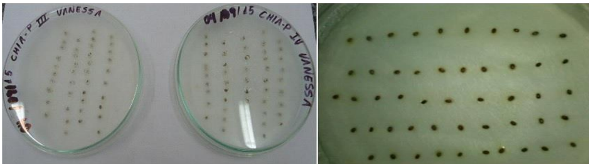
Figure 1: Detection test seeds of Chia.