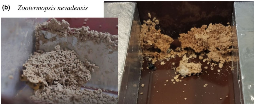
FIGURE 3 Pictures showing shelter tubes constructed by (a) Hodotermopsis sjostedti and (b) Zootermopsis nevadensis . Observations were made under laboratory conditions. The shelter tube construction was stimulated by starving condition and nest damage

structures can be distinguished in terms of their complexity; tunneling is mainly performed by excavation and can be considered as an extension of feeding activities (Emerson, 1938), while shelter tube construction requires specific deposition patterns to form tube-like structures. We collected literature data to shed light on the evolution of shelter tube building abilities in termites. We focused our endeavors on the 150-million-year-old lower termites, which form a paraphyletic group including all termites but Termitidae, as they can provide insight into the origin of termite social systems (Abe, 1987; Inward et al., 2007). We did not further consider the 50-million-year-old higher termites (all Termitidae) in this paper.