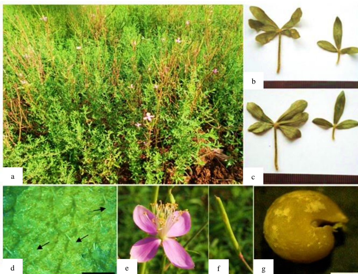
Figure 1. Cleome chelidonii L.f: a. habit; b. adaxial leaf surface; c. abaxial leaf surface; d. bulbous hairs (black arrows); e. flower; f. fruit; g. seed. Bar scale=0.25 mm.

At the observation site, Cleome chelidonii abundantly grows in rice fields and watery places. Therefore, the dispersal of the seed is allegedly aided by water. In addition, the ripe fruits easily to break and throw the seeds away. Jacobs (1960) notes that the seeds do not have an elaiosome. Thus, the possibility of the seeds being spread by ants is very little.