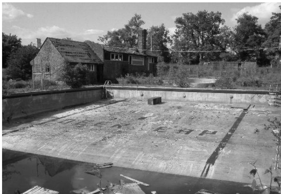
Figure 1. Urban decay: Abandoned swimming pools

Photo 1, featured below, illustrates the type of decimation that occurs when public swimming pools are abandoned due to budget and policy decisions or demographic shifts that occur in once densely populated areas. Unfortunately, the abandonment of swimming pools, especially in urban areas, becomes a significant marker for the progressive decay of urban communities.