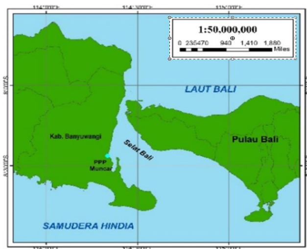
Figure 1: Map of Research Location

This research was conducted in May 2018. The research location was in the Beach Fisheries Port of Muncar (PPP Muncar), Banyuwangi, East Java.