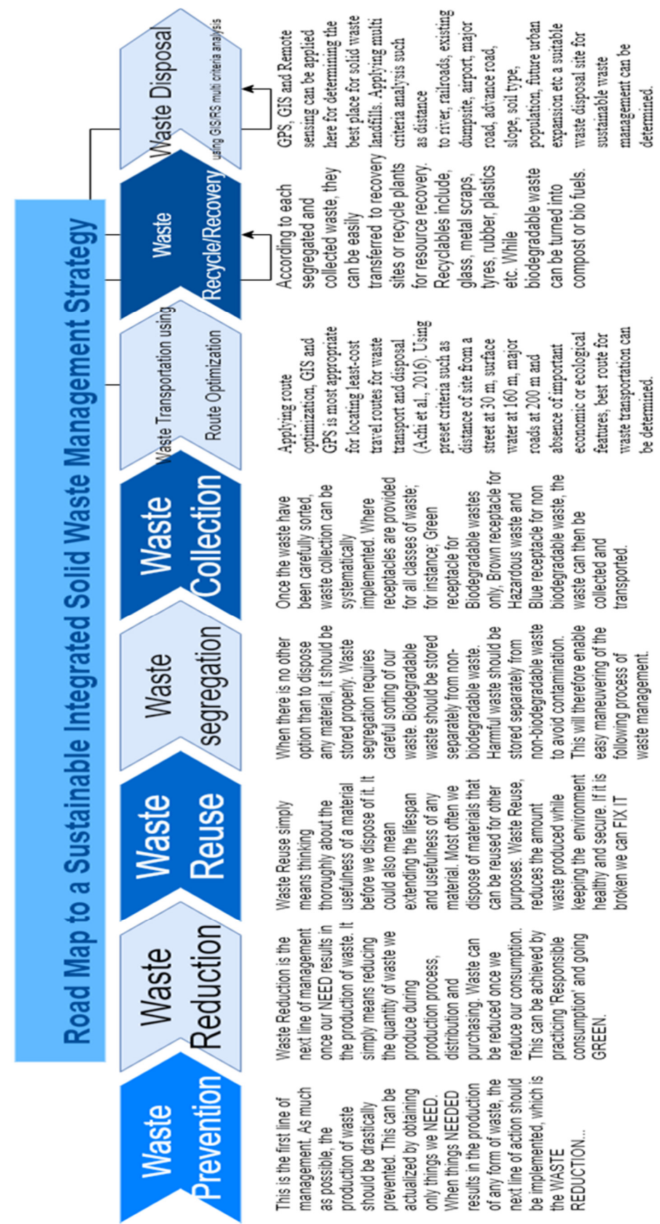
Fig 3: showing a road map to a sustainable integrated solid waste management strategy.

The Fig 3 above synchronized all waste management strategies, that, in one way or another, is employed by the Waste Authorities in Nigeria. Drawing from the rich benefits of the WMS to both the environment and the