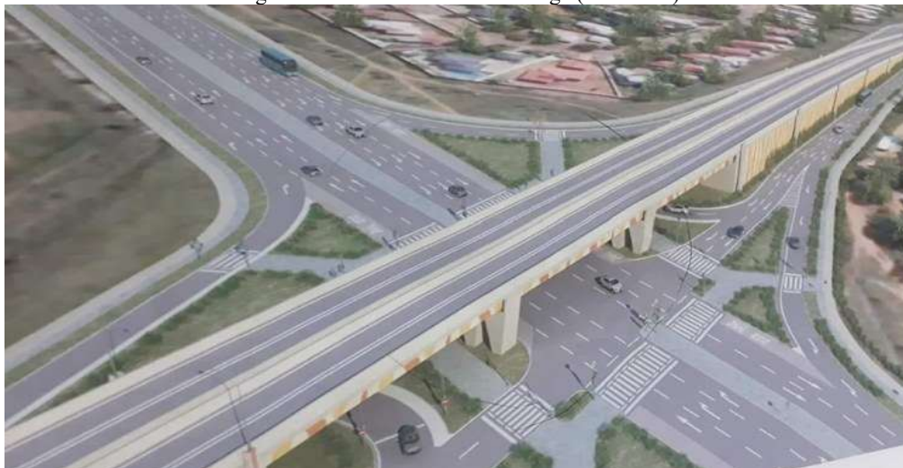
Figure 4 .1: Francistown Interchange (Botswana)

Francistown in 2016 (see Figure 4.1 ) and the Boatle interchange in May 2019. These infrastructure development projects have been widely received by motorists and urgent need is advocated for to follow suite in Gaborone as a big measure to reduce traffic congestion. Note has been taken also that most roads in Gaborone are not user friendly as they lack immediate turning points, this will make motorists travel unnecessarily into some areas contributing to congestion when they would have turned back. Roads should be re-designed to allow motorists many options to turn sideways or back. Roads should be designed in such a way that more than one road can be used to reach a major economic point like the Malls and residential areas, this will go a long way in reducing traffic congestion as motorist share the existing road options.