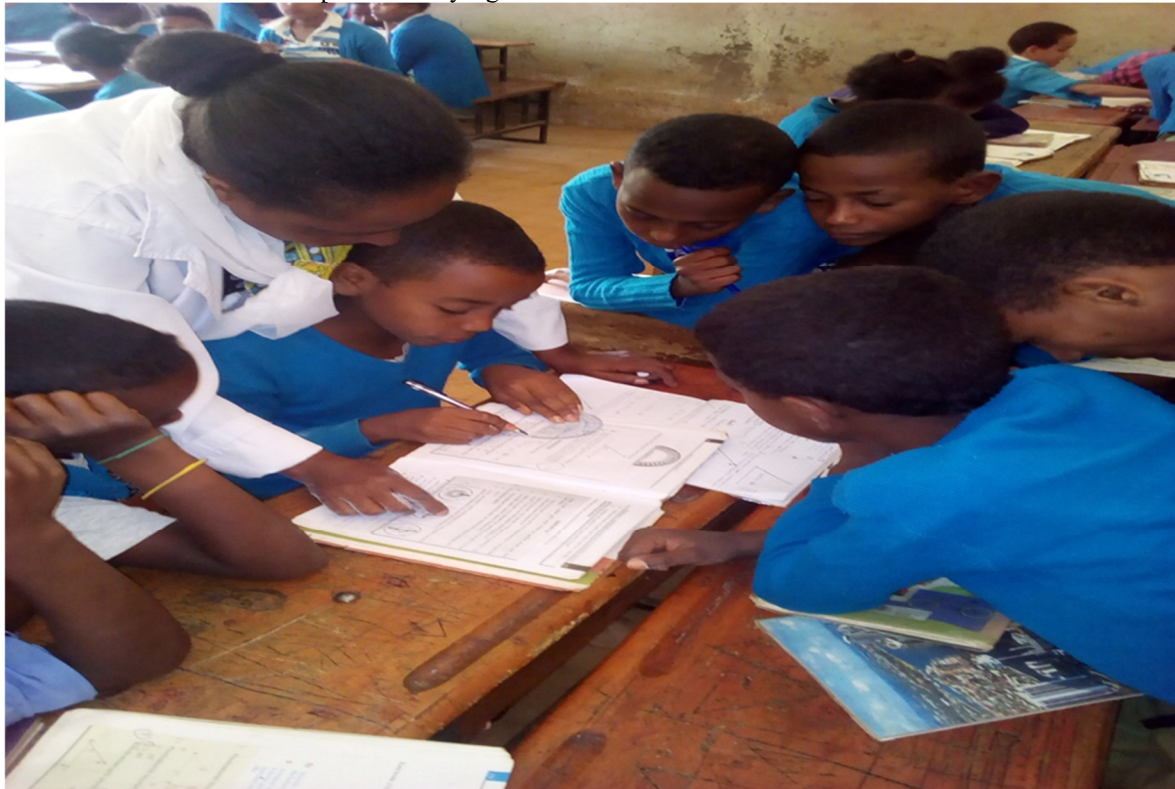
Fig 1: Grade 5 Students Measuring in Group the Given Angle Using Protractor