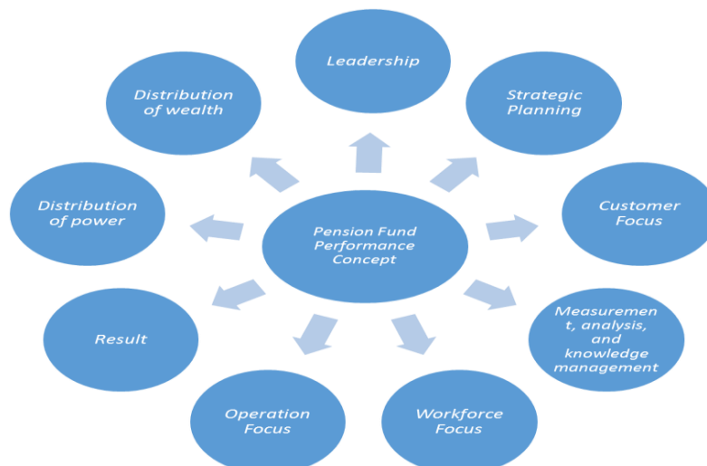
Figure 3: Modified Baldrige Assessment

In this study, formulating the performance assessment concept was done by combining Baldrige Assessment method. This method was initially introduced in 1989. In this method, assessing performance uses criteria that are known as the seven pillars ( Baldrige, 2013 ) and when observed, these seven pillars are indeed very crucial in determining the progress and the retreat of an organization (both business organizations and public organizations). Those seven pillars or criteria of Malcolm Baldrige are as follows: The first pillar is Leadership ; the second pillar is Strategic Planning ; the third pillar is Customer Focus ; the fourth pillar is Measurement, analysis, and knowledge management ; the fifth pillar is Workforce Focus ; the sixth pillar is Operation Focus ; and the seventh pillar is Result . This Baldrige Assessment method is combined with the theory of Political Economy of Accounting (PEA) which includes the fair distribution of wealth or prosperity ( just and fair distribution of wealth ), and relation between distribution of power and distribution of wealth ( relation of power and wealth ). This is in accordance with the purpose of the establishment of pension fund, which is for the welfare of pension fund participants at their retirement age, due to disability or death both financially and non-financially (Act No. 11 of 1992). Indeed, the formulation of performance assessment concept of pension fund can be seen in the following figure.