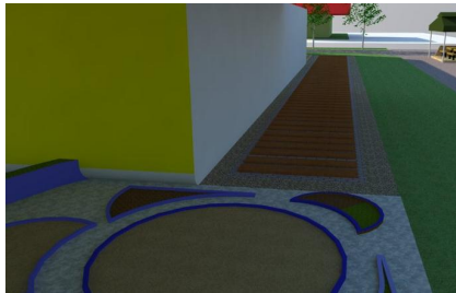
Fig.8 Transition Zone