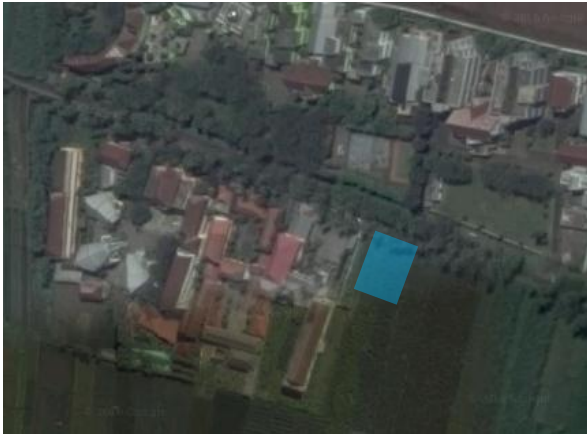
Fig.1 The Map Of Study Area