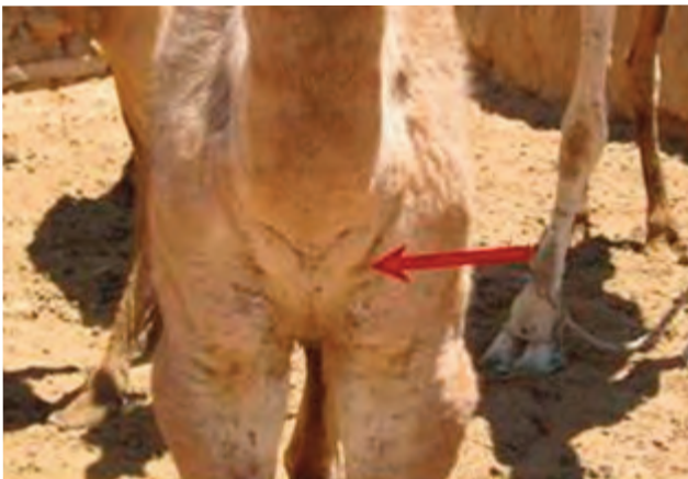
Fig. 1. Bilateral enlargement of superficial cervical lymph nodes in a camel-calve.

Camels infected with Theileria camelensis did not show any abnormal clinical signs except in three cases, that showed fever and enlargement of lymph nodes, especially superficial cervical lymph nodes (Fig. 1).