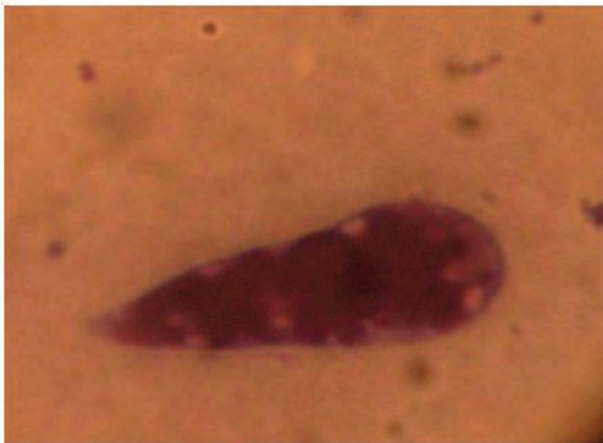
Fig. 3. Haemolymph smear from Amblyomma variegatum showing Theileria kinite .

quencing work is being planned to identify the parasite.