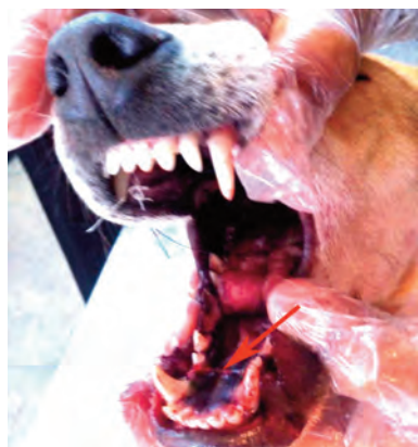
Fig.1. Photograph showing complete fracture of mandibular body.