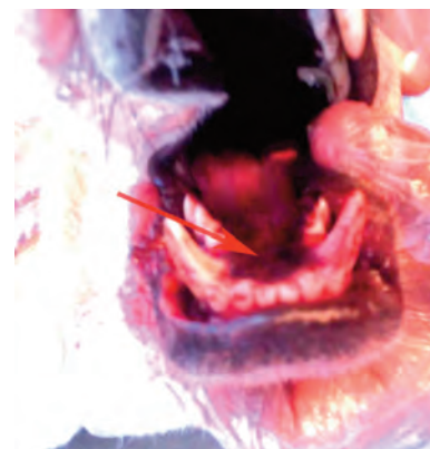
Fig.3. Photograph showing complete recovery mandibular fracture after 37 days.

cision on mucous membrane was given to clear the site for drilling. Two holes, behind the canine teeth and in-between 1st and 2nd premolars were made laterally to horizontal ramus. A 4" piece of stainless steel wire of 20 gauge laterally inserted to first hole (in between the 1st and 2nd premolars), which ejects outside from other hole (behind the canine teeth) after passing from the medial side (oral cavity). Three twists were given to wire and piped after cutting the extra wire (Fig. 2). After stabilization, a simple interrupted suture was given to close the incision site. The same protocol was applied on the opposite side mandible.