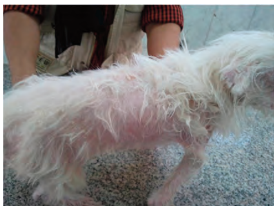
Fig. 2. One year old Griffon dog infested with Sarcoptes Scabiei mites.

The three acaricides have the same successful treatment rate (100%) at the fourth weeks post treatment. While it is clear that Doramectin injection (Dectomax®) can cure 4 (50%) of the treated dogs at the end of the first week post treatment. From the economic point of view, Ivermectin tablets (Ivactin®) is the cheapest and he is also easily administered when compared with the other two acaricides.