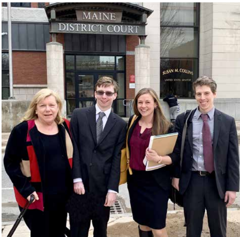
Student attorneys arrive at Lewiston District Court to assist clients seeking Protection from Abuse Orders.

"I would just like to say thank you from the bottom of my heart for your help. You made a difficult and painful experience more bearable."