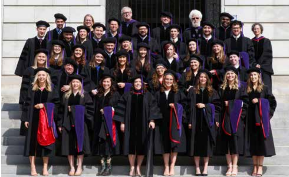
The Cumberland Legal Aid Clinic Class of 2019 with the Clinic Faculty on Graduation Day.

The Cumberland Legal Aid Clinic's mission is two-fold: educating law students through an intense, high-quality clinical and mentoring experience while providing free legal aid to Maine residents with low incomes. It is a defining program of Maine Law, providing practical skills training for students and helping to fulfill the school's commitment to social justice.