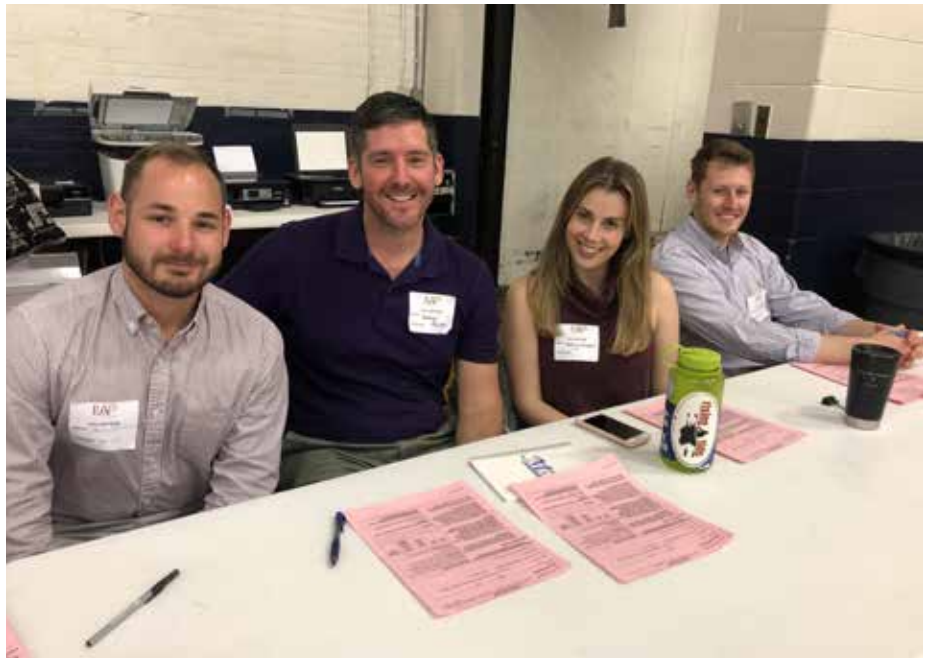
Clinic students participate in a day-long legal outreach event at the Portland Expo for new immigrant arrivals

Student attorneys provided legal assistance in cases involving foreclosure, landlord/tenant, recovery of personal property, power of attorney, administrative appeals, adult guardianship, protection from harassment, real estate, recovery of unpaid wages, tax liens, name change, education, tort defense, power of attorney, and changing gender identity markers on legal documents