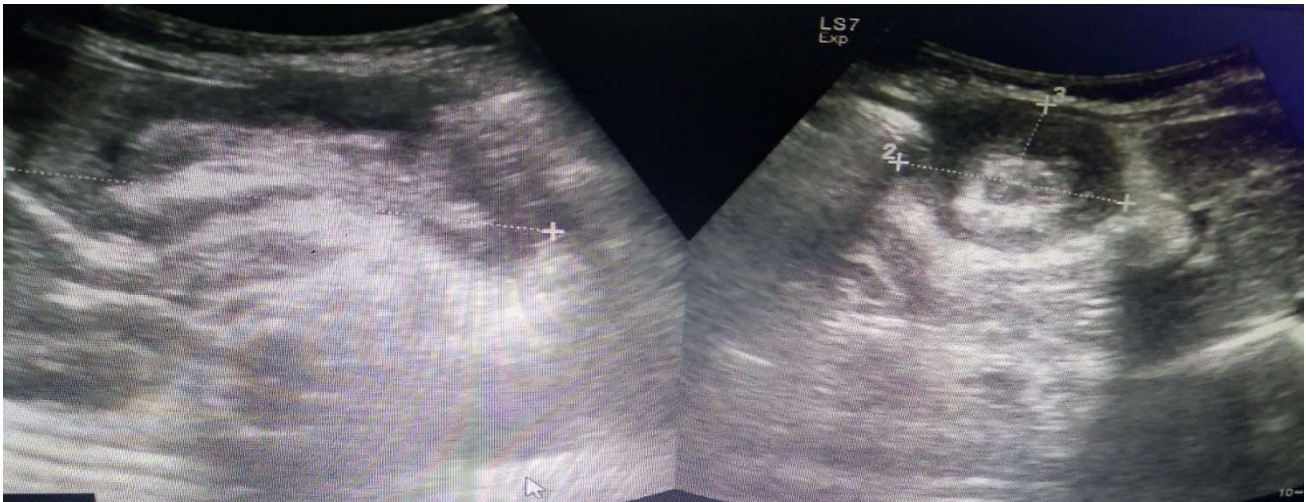
Figure 1. Ultrasonographic appearance of the abdomen of the child

Legend: Target sign of intestinal intussusception.