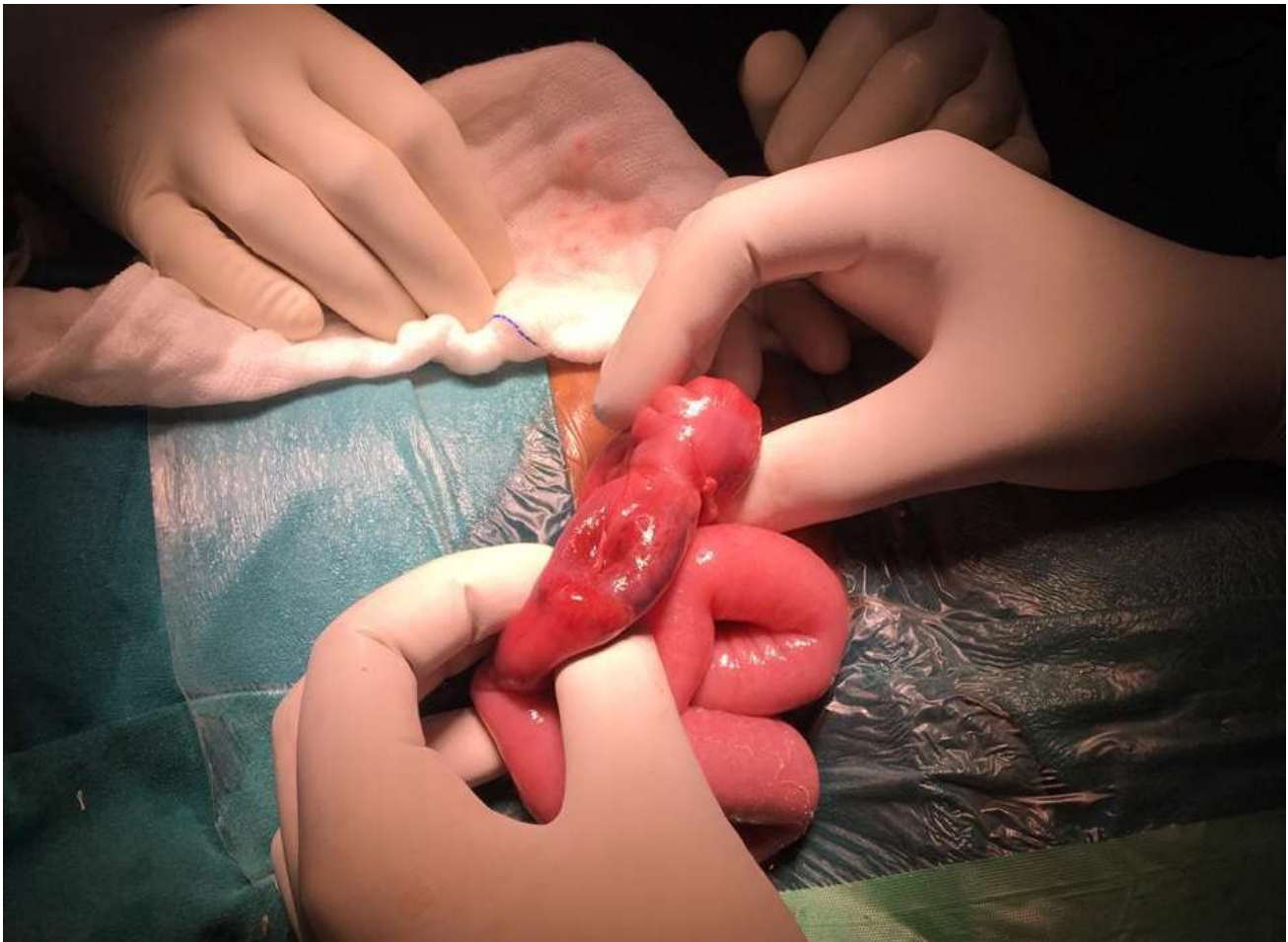
Figure 2. Laparoscopic reduction

Legend: Telescoping invagination of an intestinal segment into the lumen of a proximal segment (ileocolic).