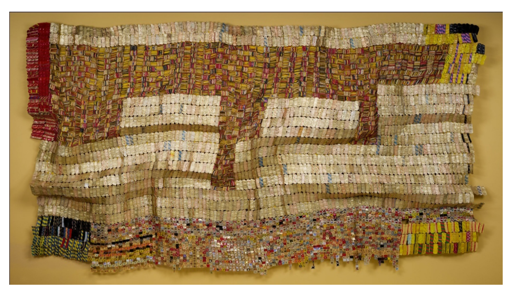
Figure 1. Between Earth and Heaven , El Anatsui, Medium: Aluminum, Copper Wire H. 86 3/4 x W. 128 in. (220.3 x 325.1 cm), 2006. ©El Anatsui. Courtesy of the artist and Jack Shainman Gallery, New York.

Spring, C. (2012). African Textiles Today (p. 236). The British Museum Press, London.