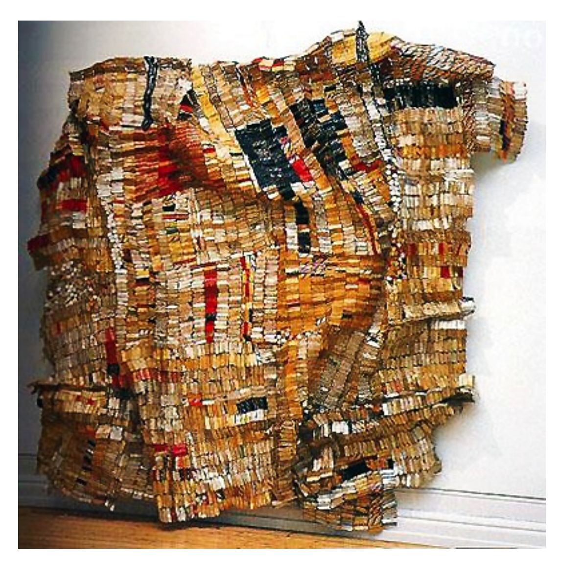
Figure 3. OLD MAN'S CLOTH, 2003, El Anatsui, Harn Museum of Art

Gainesville, Florida, aluminum and copper wire, 487.7 \times 520.7 \otimes El Anatsui. Courtesy of the artist and Jack Shainman Gallery, New York.