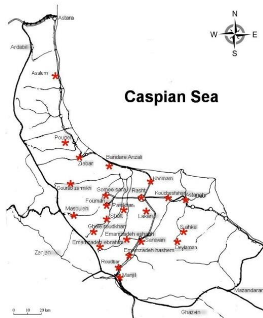
Figure 1. Guilan Intercity Road Network Map

The intercity road network of Guilan province, which has been selected as the case study, is a node-arc network. It means that the nodes represent cities or intersections and links connect them over the road network. The road intercity network includes 46 nodes and 126 two-way edges. Two-way edge means that two opposite directions of movement are available. The risk level for each link has been estimated in another study conducted by a student in MehrAsthan university published in Persian language (Mahmoudabadi & Abouhashemi, 2016). The ranges of distance and the risk assessed at each return link are assumed equal to the main link. The length of each edge in the network is also available and derived by the map depicted in Figure 1.