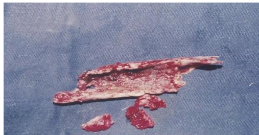
Figure 2. Picture of Some Sequestra Removed from the Infectious Foci

The patients were treated using the Papineau technique consisting of open wide resection of all the bone sequestra (Figure 2).