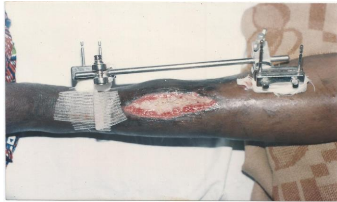
Figure 3. Picture of the Wound Completely Filled with Fragments of Cancellous Bone, and the Limb Immobilized by Hoffman Fixators

Daily drip irrigation of the grafts started using 1 liter of saline for 2 hours a day, for 45 days until the grafts were incorporated within the granulation tissue. Skin cover will be achieved by spontaneous healing or by a third step consisting of skin grafting. Radiography was necessary to control cavity and to decide when the immobilisation would be discarded and the limb might be allowed to bear weight.