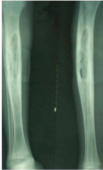
Figure 1. Frontal and Lateral Radiographs of the Tibia and Fibula with a Large Hypodense Lesion and a Sequestra Inside the Tibia

The patients were treated using the Papineau technique consisting of open wide resection of all the bone sequestra (Figure 2).