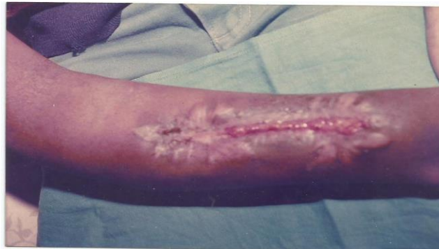
Figure 6. Picture of Skin Covering the Wound

The prognosis is depending of authors and technique used (Bauer, Litellier, Mamoudy, & Lortat-Job, n.d.). Anyway, in our series, the percentage obtained after Papineau (99%), remains a solution for those chronically sick patients who find the joy of walking like everyone else and going about their business. An obvious consolidation of the treated bone is a satisfaction for us and especially for the patient and his family with good repair of bone and soft tissue (Figure 6) otherwise amputation.