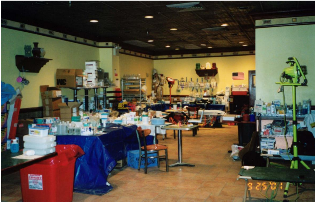
Image 3. ACS Established at Ground Zero Following Attack on 9/11/2001. Local Deli Converted to Provide Emergency Care.

There are five basic ACS types that can be derived from the literature.