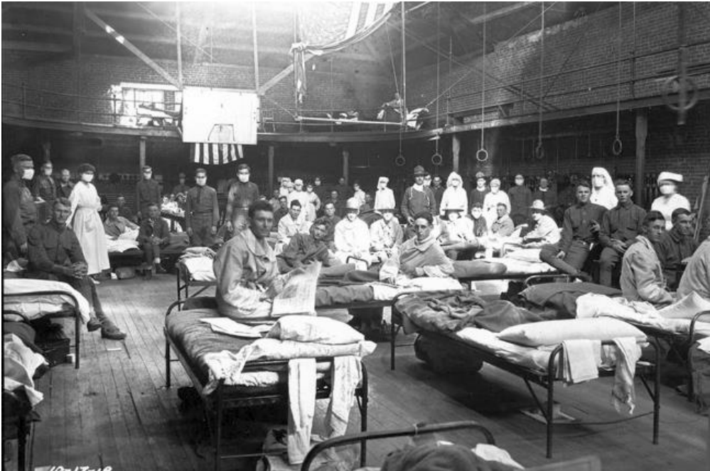
Image 1. University of Kentucky Gymnasium during 1918 Influenza Pandemic.

While not delineated in this manner, the literature suggests an effective response system requires four basic capabilities that will be referred to as: