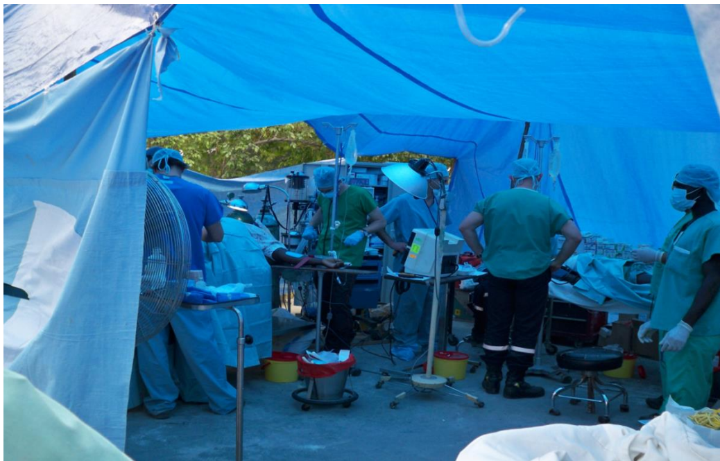
Image 2. Alternate Care Site: Surgical Unit in Haiti Following 2010 Earthquake.

During this surge, multiple alternate care sites will be required, with each ACS likely having different functions. The literature supports that establishing and operating an ACS is a local responsibility (Florida Department of Health, 2013). However, there is minimal agreement on capabilities or services to be offered at an ACS during a surge following an infectious disease outbreak. The author's experiences confirm that services offered will vary greatly, and the resulting model will be shaped by the incident. The model and operational dynamics of ACSs established at ground zero following the collapse of the World Trade Centers on September 11, 2001 were very different from those following the 2010 earthquake in Haiti (Images 2 & 3).