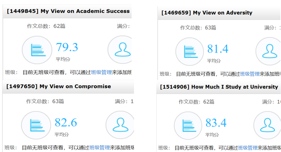
Figure 8-11 Screenshots of average writing score

In addition to using the automatic scoring system of Pigai.org , I also checked and analyzed the four essays of some of the students, and I found that their vocabulary and grammatical errors were reduced to a certain extent. There was a certain degree of improvement. At the same time, after the completion of the third writing training, I randomly selected 10 students for a simple interview, mainly to ask the students' acceptance of the use of Pigai.org for teaching, whether they themselves think that their writing level is improved by using Pigai.org and whether Pigai.org can effectively stimulate students' interest in learning English writing.