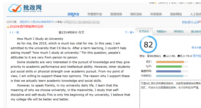
Figure 3 the interface of scoring and commenting

Students will receive systematic feedback soon after submitting their writing, which includes their total points, vocabulary, sentences, structure, and chapter content.