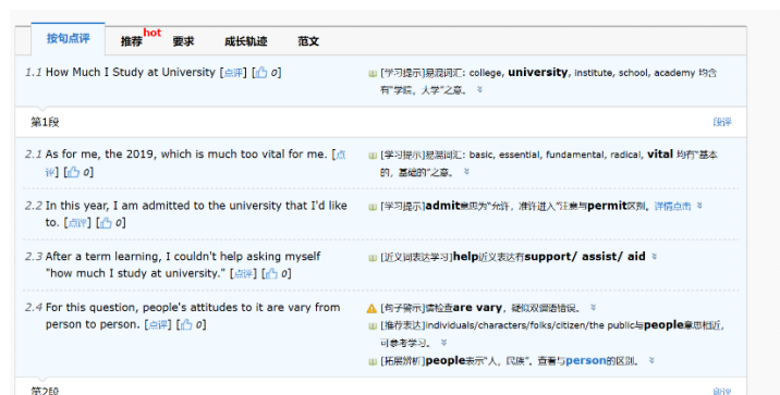
Figure 4. the interface of commenting sentence by sentence

In addition to feedback to the student's total score and words, sentences and other grades, Pigai.org also provides a function of sentence by sentence commentary, so that students can know their writing problems. It also provides students with synonyms, recommended expressions, etc.