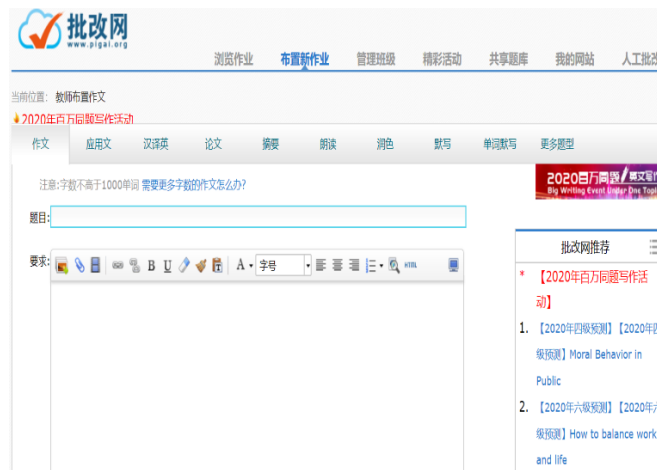
Figure 1 the interface of writing assignment