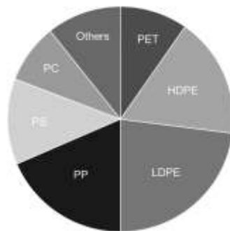
Figure 1. Plastic wastes composition [1]