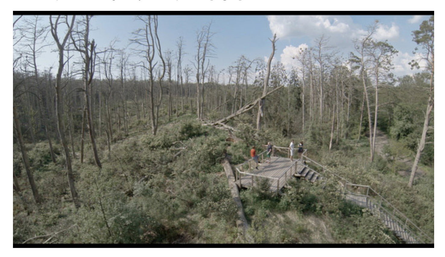
[Fig 2:] Still from the movie Acid Forest, directed by Rugilė Barzdžiukaitė, 2018

The documentary creates an interesting optical structure in which humans coming to the observation site – a kind of objet trouvé – are exposed for observation themselves. In 63 minutes of documentary we see the visitors of different ages, genders, races, and nationalities. Observed from a certain distance, from a bird's-eye perspective, humans lack individual features and seem to be like a faceless mass: this creates an effect of desublimation, presenting humans as one of the species among many other species. [Fig. 2]