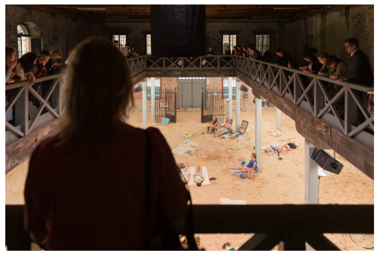
[Fig 4:] Sun & Sea (Marina), opera-performance by Rugilé Barzdžiukaitė, Vaiva Grainytė, Lina Lapelytė. The Lithuanian Pavilion at the Biennale Arte 2019, Venice.

visuality had a pacifying effect, presenting human activity as being right, moral, and aesthetic, post-Anthropocene visuality, or reversed visuality, works as a critique of human inactivity and incapacity to react in face of climate emergency.