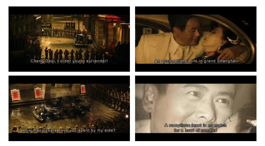
Immortalized – Cheng's death in The Last Tycoon, Chinese nationalism with Hollywood conventions. The last shot: Cheng's frozen face fades to white as the theme song plays on.

In The Last Tycoon Cheng's death is glamorized to the hilt. At the end of the film Cheng and his underlings destroy a host of Japanese occupiers and their military installation after which he kills arch-enemy General Mao. After the carnage he carries wife Bao, who died in the battle, into a limousine where trusted lieutenant Fatso waits in the driver's seat. The car is surrounded by Japanese soldiers who order them to surrender. Cheng calmly orders "Let's go", and Fatso starts the car. Cheng and Fatso die with a content smile on their faces as the car is riddled by Japanese bullets. The film's theme song with its chorus 'an accomplished life in great Shanghai' comes on and a black and white montage of Cheng's life begins.