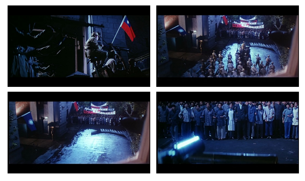
Antagonistic compositions: The KMT massacre the workers demanding the release of the labor leaders, as the three tycoons helplessly watch on.