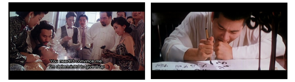
Luk battles with opium addiction and illiteracy in Lord.

Lord has a greater number of protagonists – it is made clear that Luk is only one of 'The Three Tycoons of Shanghai' and operates with his trusted accomplices such as Shan and Ting. Luk has moments of victory, especially against the established elites such as warlord Lu and the financial bourgeoisie, and of course, rises in the ranks of the crime organization. However, Luk suffers setbacks as well, for example he is manipulated throughout the film by many, especially the KMT (henceforth KMT), who he can never outmaneuver and is finally forced into exile by forces beyond his control. The fact that Luk is illiterate is brought out often in Lord , for example, in a lengthy and somewhat isolated scene in which he asks a child to read his girlfriend's goodbye letter to him. Also, later Luk takes great pains to learn to read and write; these efforts inter-cut with his painful attempt to kick his opium habit.