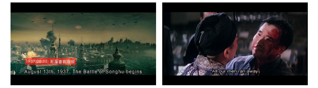
Digital nationalist spectacle/blockbuster: planes over Shanghai in The Last Tycoon and the bloodied Ting returning from the front in Lord.

War and combat are portrayed differently in the films. In Lord the gangsters provide a militia to counter the Japanese that proudly march to the front. The men come back in a different disposition, burly Ting of Luk's gang crying: "The bombs dropped like rain. I can't face the people of Shanghai; I did not kill one single Japanese, I did not see them". Several of the gang members are killed on the front, their maimed corpses shown to the viewer and a weeping Luk as they are hauled back to Shanghai. Actual combat itself is not shown in Lord, unlike in The Last Tycoon where the war is shown as a digital nationalist spectacle of computer generated action scenes. A bloodied, crying little girl thrown into the mix, a quotation of H. S. Wong's photograph Bloody Saturday , one of the most famous images of war that was distributed around the world after it was taken on August 28,1937 during the Japanese air attack on Shanghai. In terms of their representation of war, and arguably the whole life of the main characters, Lord is a story of victimization and The Last Tycoon a heroization. Luk does not participate in the actual fighting and evacuates to HK, in The Last Tycoon Cheng even though going to HK cannot stay away, and returns to kill Japanese agents and soldiers by the dozen.