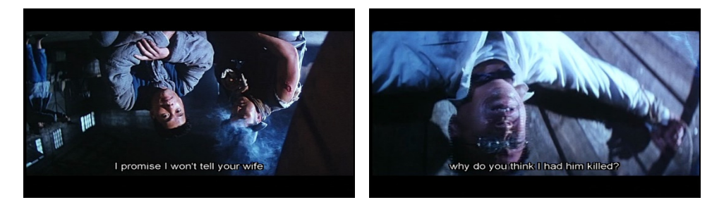
The tables are turned on the Minister of Railways.

In a refinement of the films' depiction of class, Luk, the social climber, is shown to be estranged from his modest roots. Uncle Head, an old food stall keeper that Luk befriended during his street days, symbolizes Luk's alienation from his class and acts as a metonymy for the working class or 'grassroots' in HK parlance. In the beginning Luk does his deals out of Uncle Head's stall on the street and the men celebrate Luk's success together. As Luk's stature grows, the men grow apart. Later in the film Uncle Head walks past Luk's house during New Year's Eve celebrations but refuses to go inside to kowtow to Luk for money. Finally Luk is devastated as he watches the KMT, with which he now is in business, massacre the leftist demonstrators and recognizes Uncle Head dying amongst them.