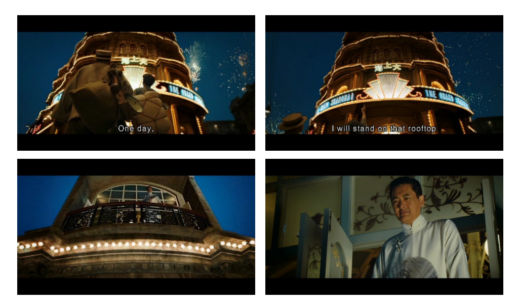
From rags to riches in one shot: Cheng (Huang Xiaoming) looks up from the street – Cheng (now Chow Yun-fat) looks down at the city.

would usually think that it would take for a poor migrant to make it in an metropolis, and is against the reality that privilege and poverty are often generational in the PRC (GOODMAN, 2014: 187). However, these images and themes resonate in a country with such a huge floating population, especially when one is often tied to the strict residency permit system ( hukou ) that understandably is also a hindrance to social mobility ( ibid. , 35-44; 187).