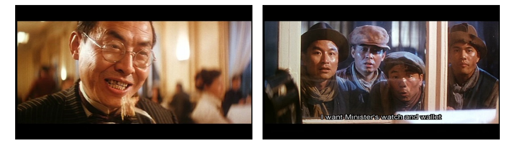
Representative of the elite: the Minister of Railways in Lord. On the outside looking in: Luk and company desire the minister's belongings.

manifest when the minister, under duress, urinates on himself. The scene in its scatology, humor, and bringing the high low bringing to mind Bakhtin's ideas of carnival.