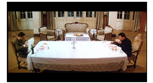
Worlds apart: Luk and Kuomingtang general Ku.

Wong Jing is also seen as a filmmaker whose work often is seen as vulgar, having abundant sex, violence, profanity, and scatology. The Last Tycoon however has little of this lowbrow substance (except of course violence) and, in terms of Wong's oeuvre, it is actually sanitized of "vulgar" content. The Last Tycoon's cleansing is indicative of the elimination of subject matter that could cause cultural friction in HK / China co-productions. Often these culturally deodorized