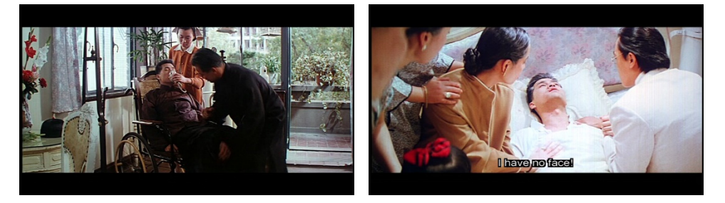
The banal end of Luk.

Gangster film and its men with their fatalistic drives, are premier terrain in popular culture to deal with death, and although the protagonist often dies, cinematic techniques are used to aestheticize the end and immortalize him. Luk's death of old age goes against this tradition. Even though surrounded by his loved ones (most notably his lifelong love Donna, who he finally gets to marry in a wheelchair in the preceding scene) Luk's death is tragic. He is broken by the asthma that escalates during the film, he is in exile in HK, and considers himself a failure. Lamenting that he did everything for money making "mountains of gold, oceans of silver" but still failed to leave wealth to his family and dies waiting for recognition from Taipei that never comes.