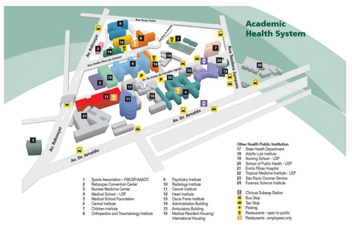
Figure 1 - The Hospital das Clínicas da Faculdade de Medicina da Universidade de São Paulo (HCFMUSP) Complex.

assessment for symptoms of infection (i.e., fever, cough, dyspnea, fatigue, myalgia, sputum production) as well as known exposures or recent travel.