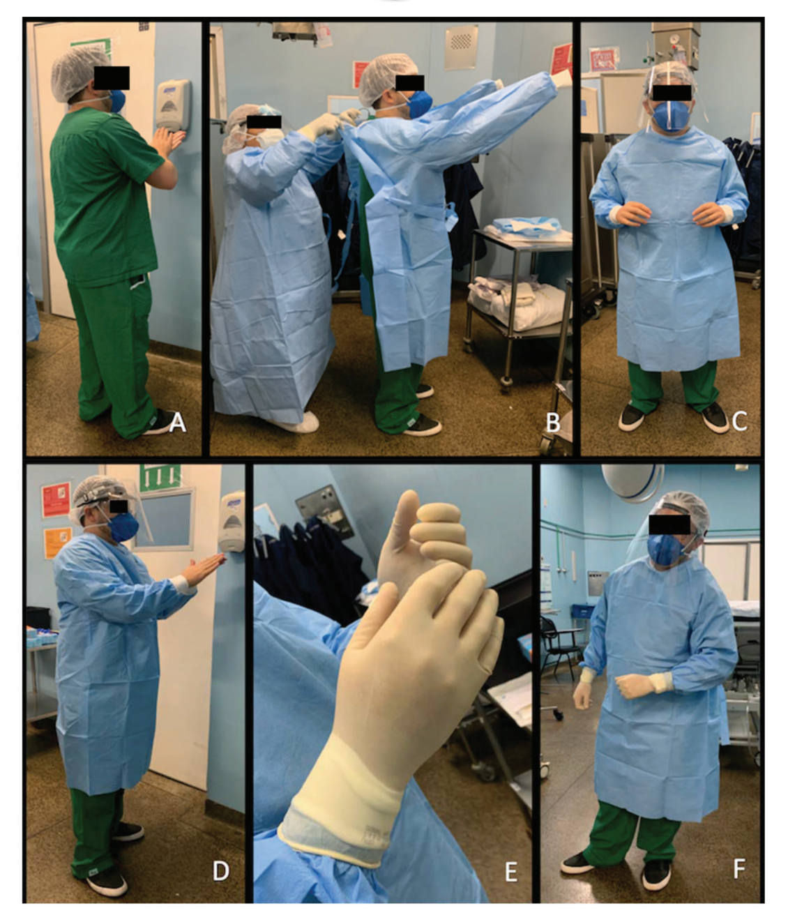
Figure 3 - Guidance for Donning PPE to be used by Healthcare Professionals during Endoscopic Procedures for Patients with Confirmed/ Under Investigation for COVID-19. First, the healthcare professional dons scrubs, closed and waterproof shoes, N95 or PPF 2 mask, and hairnet in the locker room. Only then should the healthcare professional enter the surgical center. Before entering the operating room, the healthcare professional must wear PPE in the dressing room (donning/doffing room): A. hand hygiene; B. don the long-sleeved waterproof isolation gown; C. put on goggles and face shield; D. hand hygiene; and E. put on gloves that fully cover provider's wrist. F. The healthcare professional may now enter the operating room. Abbreviations: PPE, personal protective equipment; COVID-19, coronavirus disease 2019.