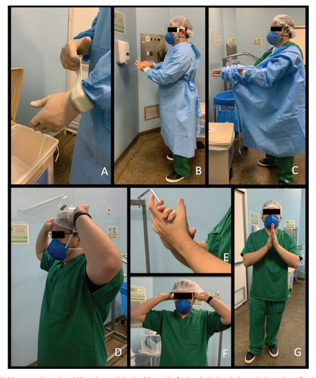
Figure 4 - Guidance on Removing PPE to be used by Healthcare Professionals during Endoscopic Procedures for Patients with Confirmed/Under Investigation for COVID-19. After the procedure, the professional should go to the dressing room (donning/doffing room) and: A. remove gloves; B. hand hygiene; C. remove and discard gown; D. remove face shield and googles; E. hand hygiene; F. discard hairnet and put on a new one; and G. hand hygiene. After these steps, the healthcare professional may leave the surgical center and enter the locker room. Abbreviations: PPE, personal protective equipment; COVID-19, coronavirus disease 2019.