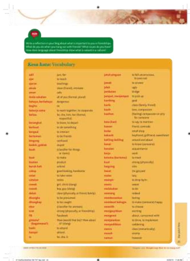
Figure 3: Blog task from nongkrong (p. 25 book 2)

Given the theoretical understanding of intercultural language learning as a longitudinal and developmental process, one further feature of the series is the ‘web-log’, or ‘blog’ (Blood 2000; Kohler, Morgan & Harbon 2010). The blog is a recurring task at the end of each chapter, which provides an opportunity for learners to demonstrate and reflect on the nature and value of their own progress.