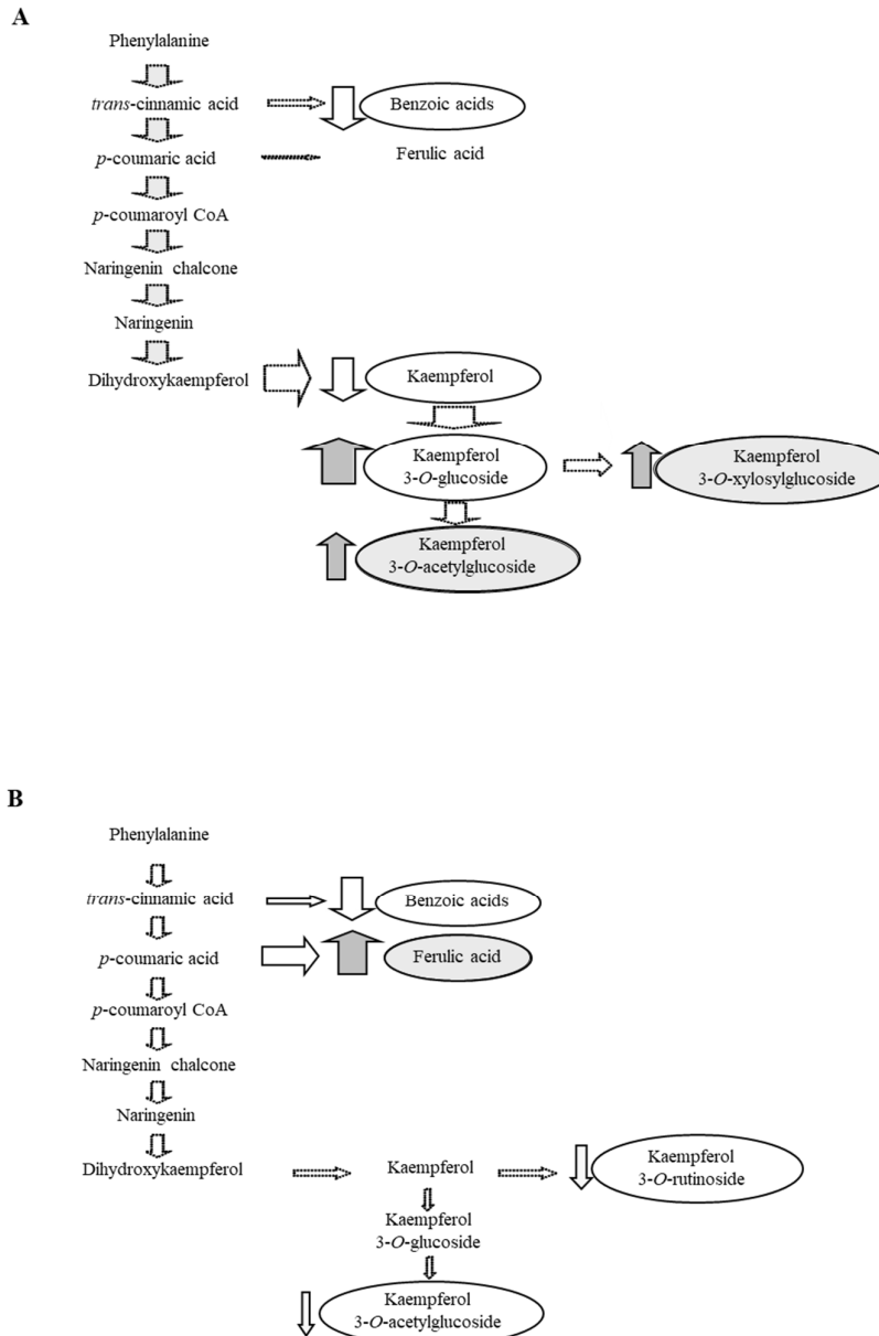
Figure 3. Simplified diagram showing polyphenol composition in relation to increasing altitude in the seed coat (A) and cotyledons (B). Only the constituents detectable in the respective seed fractions were illustrated in circles with the accompanying arrows indicating either an increased or decreased content with increasing altitude. The width of the arrow next to each component is a relative indication of the pool size with increasing altitude.