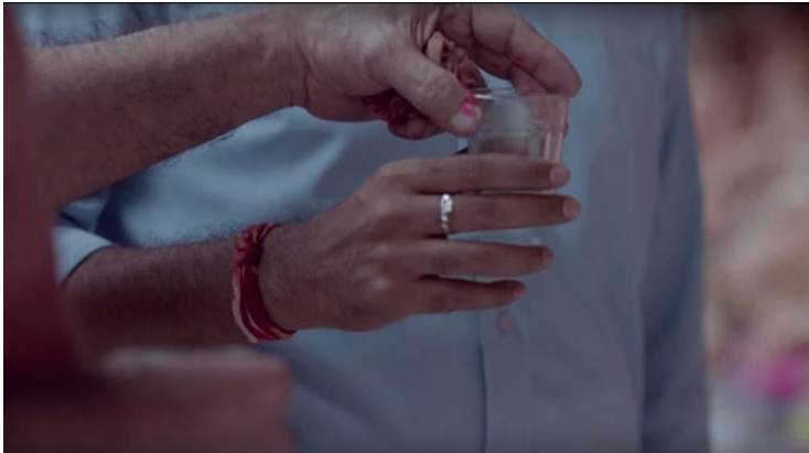
Still from the “#Shri Ganesh Apnepan Ka” clip.

In the clip, a young man in business attire who the viewer immediately assumes to be a Hindu enters a pandal and looks around for a Ganesh idol. The young man is impressed by the old idol-maker’s deep religious knowledge and is about to select an idol when he sees that the old man has quietly put on his taqiyah (prayer cap) upon hearing the azaan from a nearby mosque. Visibly startled as he realizes that the idol-maker is a practicing Muslim, the young man pretends that he has some urgent business to do and will return the next day. Knowing exactly what is going on in the young man’s mind, the old man asks the young man to at least have a cup of tea with him before he leaves, and the young man accepts the invitation. He ultimately decides to buy a Ganesh idol which the idol-maker had recommended to him at the beginning of their conversation.