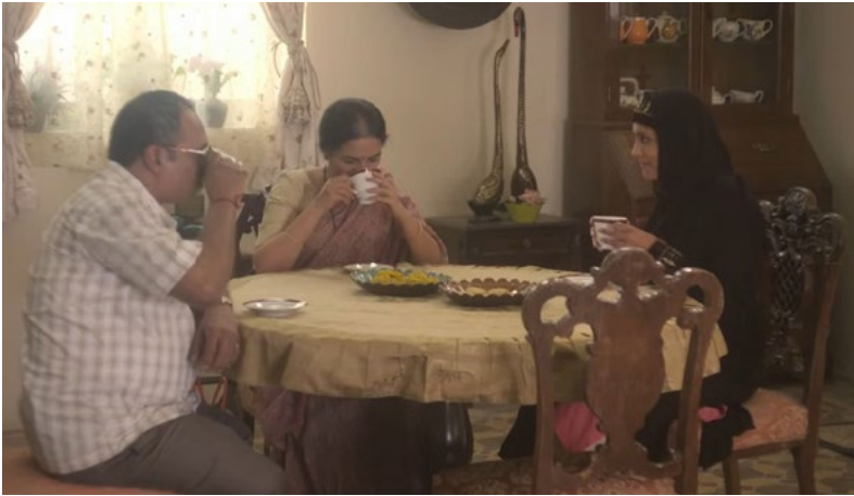
Stills from "Swaad Apnepan Ka: Neighbors," Brooke Bond Red Label India, 2014.

women to a greater extent than other religions do. Muslim women, compared to women of other religions, are most often perceived as submissive, reserved, fragile, and, due to their social conditioning, unable to fight for their own rights. See Sabina Kidwai, Images of Muslim Women: A Study on the Representation of Muslim Women in the Media (New Delhi: WISCOMP, 2003).