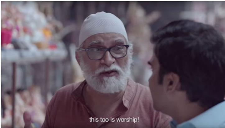
Stills from the “#Shri Ganesh Apnepan Ka” clip.

In Islamic contexts, the Arabic word ibadah (Hindi/Urdu: ibaadat ) is usually translated as ‘worship.’ It refers primarily to religious rituals, but work can also be regarded as worship in Islam, and from the perspective of care ethics, paying attention, responding sympathetically and even empathizing with the visibly irritated young man could also be considered as work.