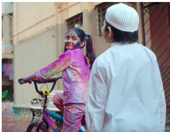
Still from the clip “#RangLaayeSang”, Surf Excel, 2019.

features two children, a girl and an – evidently religious – Muslim boy. While all the other children in the clip are wearing non-traditional clothing (and are hence not visually marked as Hindu or religious), the boy is wearing a shalwar kameez and taqiyah (prayer cap). In the clip, the girl encourages the other children to throw balloons filled with colored water at her. She does this until the children have run out of balloons, which ensures that her Muslim friend can attend the nearby mosque to offer namaaz without ruining his white clothes. The clip ends with a female voice telling us that stains are good if you get them while doing good: “Agar kuch achha karne mein daag lag jaaye, toh daag achhe hain.”