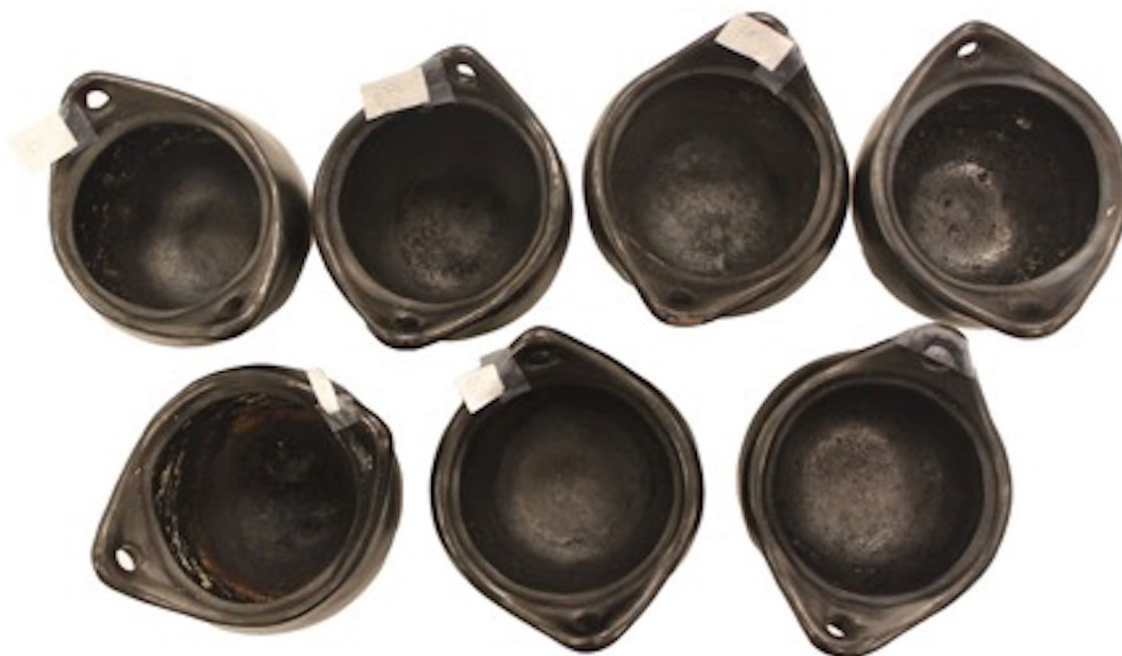
Figure 1. Unglazed “La Chamba” pottery used for each cooking experiment; photo taken after the final cooking event (carbonized organic patina residue and charred macro-remains are visible inside the pots).