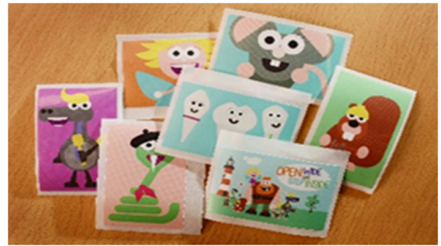
Fig. 1 “Open Wide and Step Inside” resources

The programme has a targeted design working with schools in the most deprived wards of the city (based on the Index of Multiple