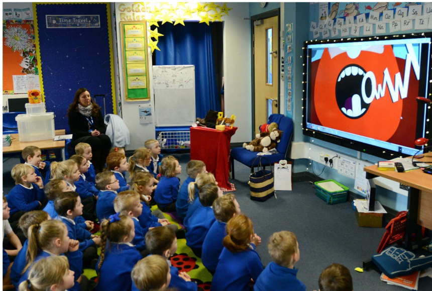
Fig. 2 Open Wide and Step Inside animation being shown in the classroom (permission to use photograph)