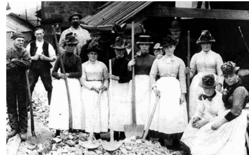
Figure 1 – Bal Maiden's from the mid-1800s

Y'n kynsa gweyth, an gwedhow istorek ha gonisogethel gwarthevyek a vewnans yn Kernow kepar hag ammeth, pyskessa, ha balweyth a yll gul heveli gorow an spas gonisogethel a Gernow. Yn hwir pan brederir a wariow gwerinek a rugbi, omdowl, revya skath hir, an keuryow mebyon, patron hevelep a omdhiskwedh dos yn-mes. Byttegyns, yn-dann hwithrans pella, diwysyansow kepar ha balweyth ha pyskessa nyns o mar warthevys gorow dell yllir y dhesevos. Kemeryn rag ensampel Myrghes an Bal, neb a derri men war enep an balyow, diskwedhys yn Figur 1.