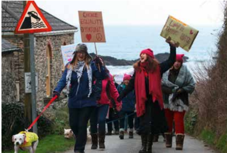
Figure 2 – Protesters march through Portholland on the first day of the Trump Presidency in solidarity with the Women’s March in Washington DC, Source: Cornwall Live (2017) 13

issues in relation to nationalist issues, rather than picking a specific cause e.g. abortion or the gender pay gap. The only exception being the organisation of feminist protests in reaction to the election of President Trump. 12