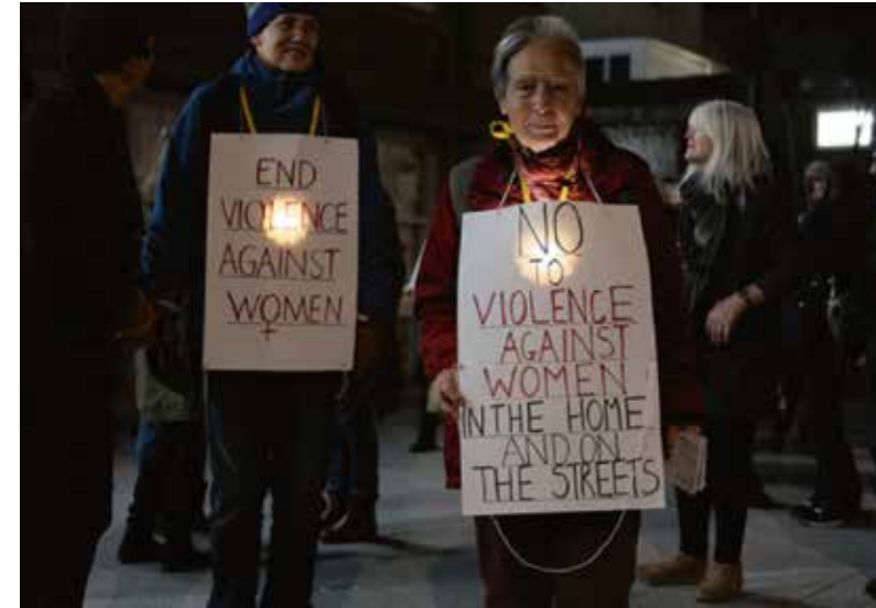
Figure 3 – Organiser of the ‘Reclaim the Night’ protest, Source: Cornwall Live (2016)