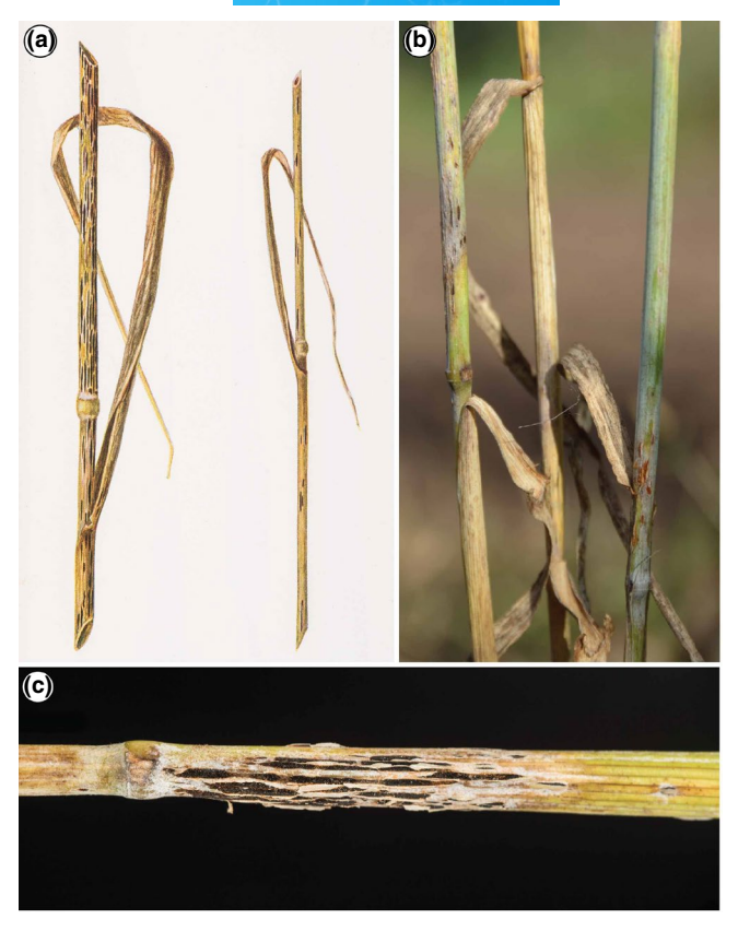
FIGURE 1 Wheat and barley infected with stem rust ( Puccinia graminis f. sp. tritici ). (a) Illustration of stem rust telia formation on wheat stems (Vavilov, 1913). (b) Black stem rust telia (left) and orange uredinia (right) were identified on the stem of a barley plant in early August 2019. (c) Erumpent black telia full of teliospores on the stem of a late sown barley plant in the UK (Orton et al. , 2019)

of controlling stem rust epidemics is encapsulated in the attempts by the ancient Greeks and Romans to placate the "Apollo of the Rust" Erythibius, and the "rust god" Robigus, respectively; the Romans established the "Robigalia" festival to appease the latter and ward off stem rust infection (Peterson, 2001). Despite the early recognition of stem rust as a significant threat to cereal crops, it was only in the eighteenth century that the Puccinia genus was first defined (Micheli, 1729) and more than a century after this that the general link between fungi and disease firmly established (Peterson, 2001). Furthermore, although an empirical connection between stem rust and barberry had been recognized as early as the seventeenth century, the complexities of the stem rust lifecycle continued to perplex farmers, botanists, and mycologists alike until De Bary's seminal experiments in 1865 finally introduced the concept of heteroecism (De Bary, 1865–1866).