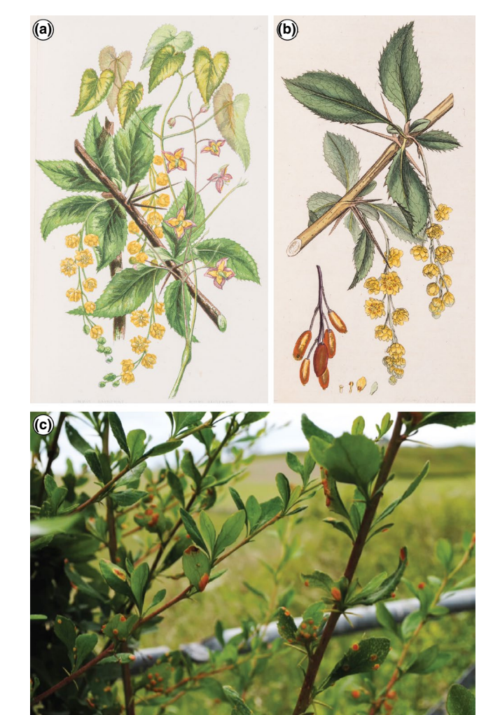
FIGURE 2 Berberis vulgaris is particularly susceptible to stem rust infection. (a, b) Illustrations of B. vulgaris , which produces yellow flowers in June and bears bright red drooping clusters of two-seeded berries in autumn. Typical spines that form on the stem and serrated inversely ovate leaves with minute hairs are illustrated (Sowerby, 1829; Pratt, 1855). (c) Yellow-orange aecia structures identified on the abaxial side of B. vulgaris leaves, typical of cluster cup rust caused by stem rust

It is now well established that Pgt requires two hosts to complete its lifecycle, undergoing asexual reproduction on cereal crops and completing sexual reproduction on Berberis (including a number of species formerly placed in Mahonia ), where recombination can lead to the emergence of novel genotypes, thereby spawning new Pgt races (Chaves et al. , 2008; Olivera et al. , 2019). However, in temperate zones such as western Europe, asexual urediniospores