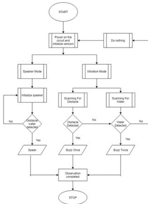
Fig. 1. Proposed system flowchart