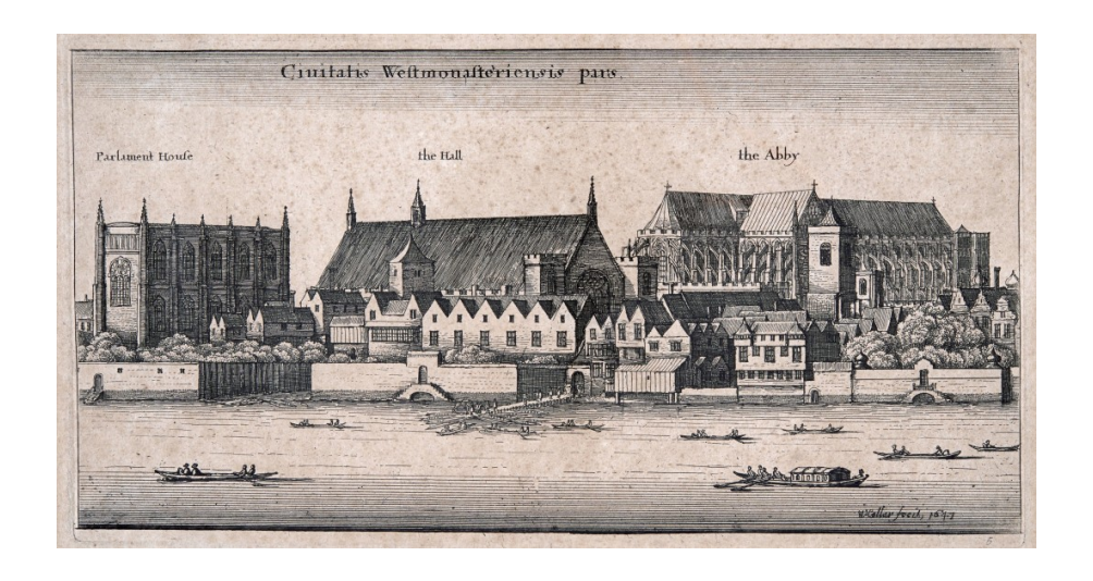
Figure 1. Wenceslaus Hollar, Ciuitatis Westmonasteriensis pars, 1647, etching, 15.2 x 28.6 cm. The "Parliament House" is on the left. Parliamentary Art Collection (WOA 845).