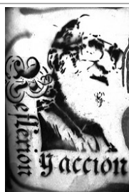
Paulo Freire

TL is a "fundamental change in one's personality involving [together] the resolution of a personal dilemma and the expansion of consciousness"