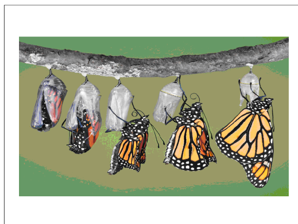
The caterpillar transforms

The term 'Transformational Learning' has been used in varied ways and with varied meanings. At its simplest, Transformational Learning is learning that takes learners' knowledge and skills into a different or new domain, with a step jump in cognitive and affective processes. Theories of transformational learning (TL) have been described as 'the process of making meaning of one's experience'. Transformational learning is 'unsettling' in that it leads to questioning of accepted assumptions and views and to new ways of knowing and understanding. The focus of research into TL has been primarily on adult learners, with the concept of TL representing a major theme of research and theory building in adult educa-