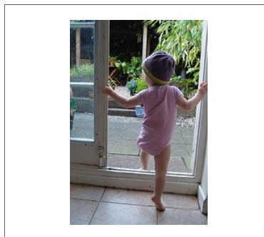
'stepping out'