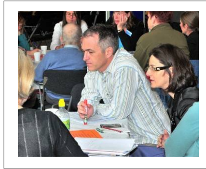
Discussing education for sustainability

Transformative Learning Conference takes place approximately once every two years. The 2009 event focuses on Reframing