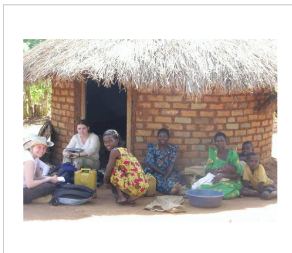
Students on the Uganda Field Trip, University of Gloucestershire

fostering transformative learning and roles and responsibilities of educators-as-facilitators and of learners in creating the environment supporting critical reflection and exploration of alternative perspectives? Most critical is establishing the roles of the teacher, the learner and the role of the rational and the affective in the TL process' (See ERIC, 200 for some reflections on these themes).