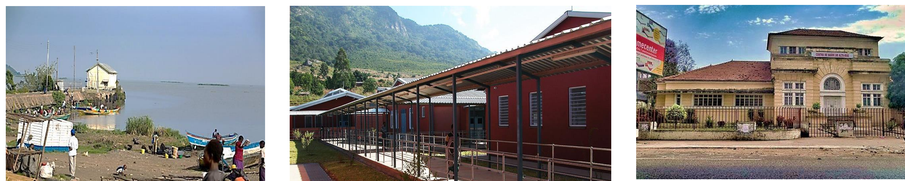
Fig. 1: Study settings and HIV clinics in the 3 sites (from left to right: Homa Bay, Chiradzulu and Maputo)