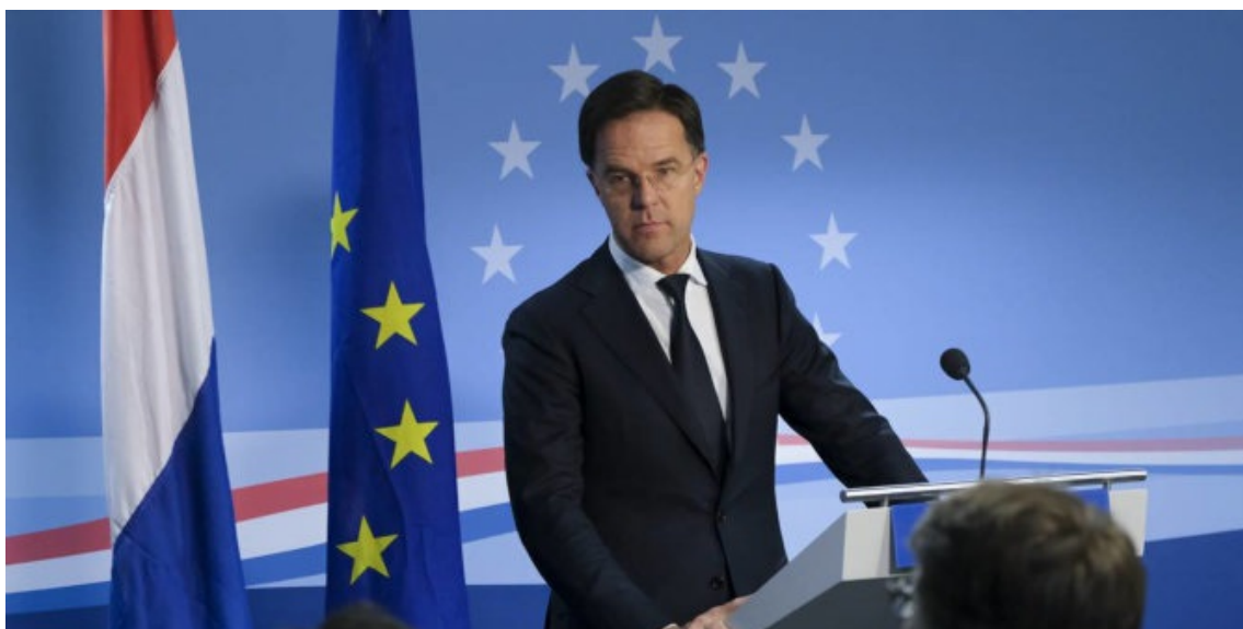
Dutch Prime Minister Mark Rutte speaking during a European Council meeting in February 2020

So the Covid-19 crisis has once again exposed the rifts between the southern and northern European economies, which previously peaked during the Eurozone crisis that erupted ten years ago. The debate about ‘debt mutualisation’ is often framed around ‘solidarity’ or ‘transfers’. Germany and the Netherlands, who have reduced their debt burden over the past years, are now called to show solidarity to help Italy and Spain. But conservative, liberal, and right-wing forces in northern countries wonder why German and Dutch taxpayers should have to make up for the past insufficient saving efforts of the southerners. German newspapers are already warning about a ‘transfer union’, suggesting that the mechanisms already apply and that policymakers should resist this alleged “injustice”. Gideon Rachman recently wrote a piece in the FT, in which he expressed his sympathies for the arguments made by the northern states. However, the article revealed in the most exemplary manner how a lack of understanding of the common debt instrument leads to spurious conclusions of what they entail.