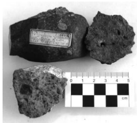
Figure 3. Examples of the volcanic rocks collected by McCormick at Possession Island. Scale in cm. NHM specimens BM 66416, 66417, 66419 (McCormick Bequest). Photograph by Philip Stone. Image prepared for publication by Brian McIntyre, British Geological Survey, Edinburgh.