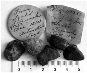
Figure 5. Pebbles recovered by McCormick from the stomach of a seal killed off East Antarctica in December 1841. Scale in cm. NHM specimen BM 75263 (Ross Collection). Photograph by Philip Stone. Image prepared for publication by Brian McIntyre, British Geological Survey, Edinburgh.