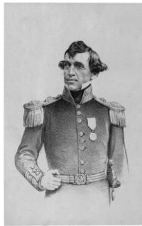
Figure 1. Robert McCormick in 1852. This image was used as the frontispiece of his autobiography and is described as a lithograph enlarged from a daguerreotype (McCormick 1884: 1 : ix).