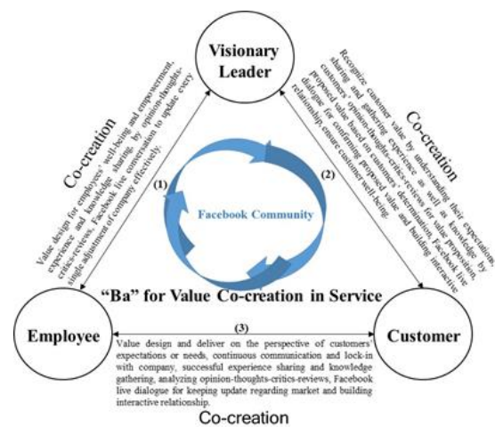
Figure 1: A model for value co-creation using Facebook as the platform

Therefore, to construct that platform a digital infrastructure is mandatory. It also ensures a wide range of value sharing forums [33] by the active participation of beneficiaries (e.g., customers) and the provider (e.g., the organization) in the process of business operation [36].