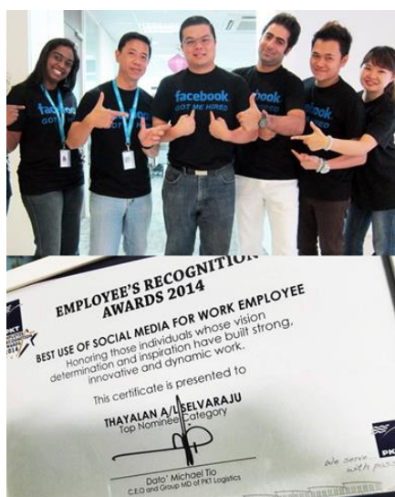
Figure 2: Facebook is compulsory in PKT corporate culture

important to design and determine the service value as well as its quality. DMT wished to connect customers, employees and himself together to communicate more efficiently and effectively for sharing and gathering knowledge, information, plans, experience, and so on among all parties, with the aim of creating a ‘flat-management system’ and offering a desired solution to all parties. In doing this, DMT relied on ICT, specifically using Facebook as a communication tool. He successfully created a “DMT-PKT Facebook community” as shown in Figure 2, where the entire staff was compelled to use Facebook including to conduct and record meetings. In short, the entire organization became ‘Facebook OK’. This was a unique approach and a successful implementation of the compulsory usage of Facebook in a corporate culture.