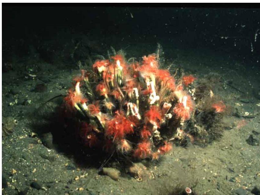
A colony of tube worms forming a small reef, Loch Creran.