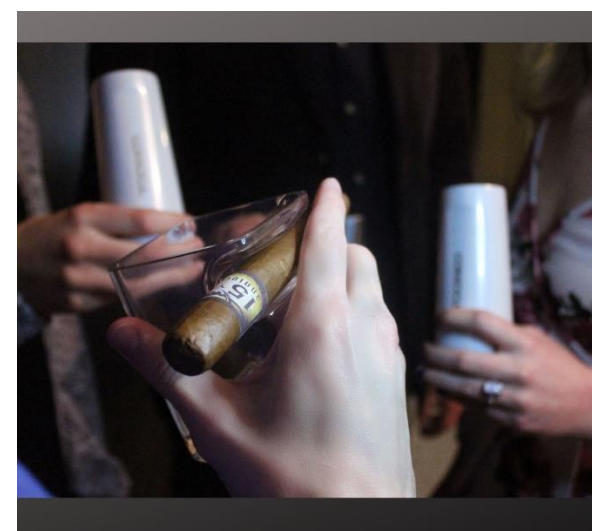
RING IN THE NEW YEAR RIGHT