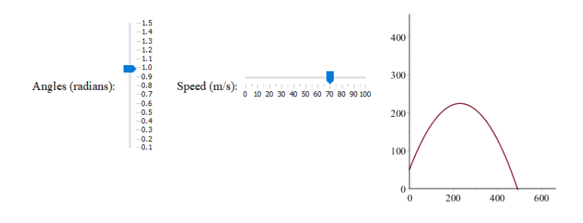
Figure 3 – First example of generalization of the resolution process.

The system has four solutions (with angles expressed in radians) but, taking into account the contextualization of the problem, only angles between 0 and 90 degrees can be considered. All students found two angles of inclination that could hit enemy galleys and they represented them graphically. Even in the generalization of the resolution process students reasoned in different ways using interactive components: we show two representative examples. In the first example (Fig. 3), students used two sliders to generalize the angle of inclination of the catapult and the launch speed. By varying two sliders, the representation of the trajectory of the catapult varies in a continuous way.