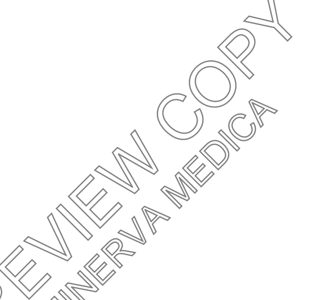
TABLE AND FIGURE LEGENDS: