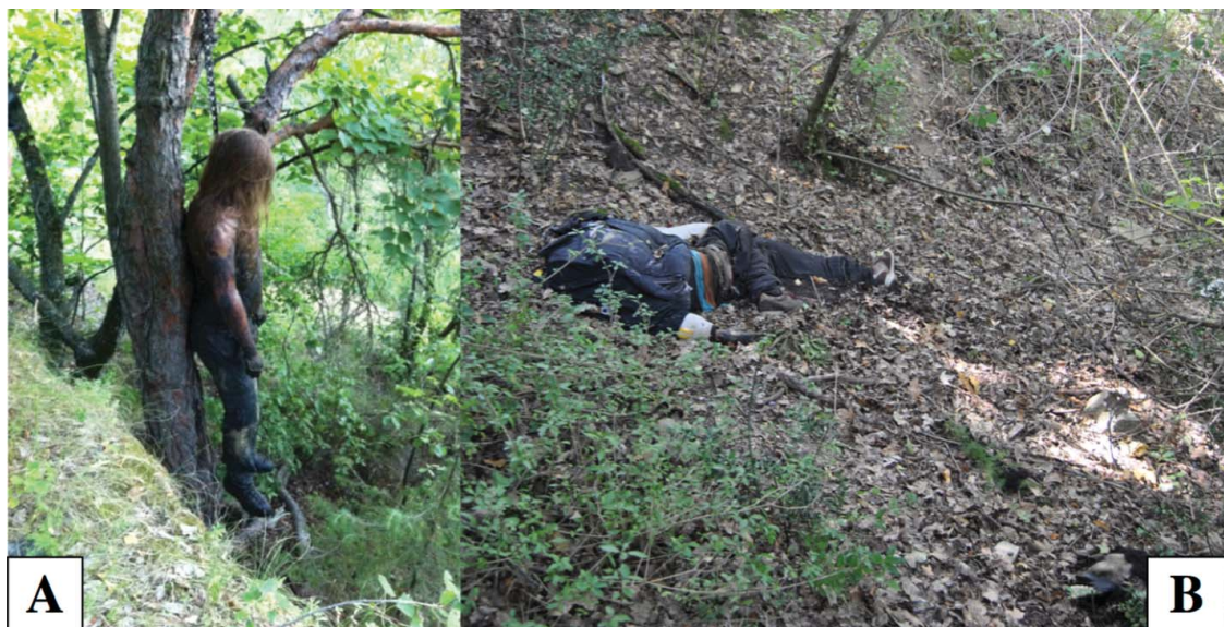
Figure 1. The remains of the two hanging bodies at the death scene: the body totally suspended in case 1 (A), the remains laying on the ground in case 2 (B).

An overall mean temperature of (21.5 ± 2.5) °C was recorded by the weather station of Villeneuve Saint Nicolas, 1.6 km far from the death scene, for the 34 days before the discovery of the body corresponding to 731 ADD. Temperature records are summarized in Figure 3. Temperature ranged from a maximum of 34.9 °C to a minimum of 9.9 °C.