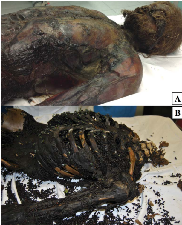
Figure 2. The decomposition pattern of the two hanging bodies: the mummified soft tissues of the upper part in case 1 (A), pre-skeletonization of the thorax and the neck in case 2 (B).

Insect activity was visible only on the face where few Diptera larvae (1.5–1.8 mm in length) were recovered. A large amount of adults and active larvae of Coleoptera were also detected from the scalp. Beetles adults and larvae represented the predominant part of the insect community. Just few Diptera pupae and puparia were recovered in the drip zone below. The insect community recovered on the body and at the drip zone was identified according to species-specific morphological identification keys as summarized in Table 1. The