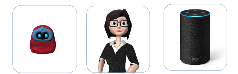
Figure 1. Alternatives: Social robot (a)[10], Embodied Conversational Agent (ECA) (b)[11], Virtual assistant (c)

that is clearly artificial compared to agents that have human-inspired characteristics [25]. Some authors suggest that the shape of the robot should evoke a familiar element, such as a toy that the subject likes, or a cartoon character. Several social robots exploit emotional features that seem to benefit children with ASD. Keepon [24] is a creature-like robot that is only capable of expressing its attention (directing its gaze) and emotions (pleasure and excitement). An empirical study with autistic children showed that the robot triggered a sense of curiosity and security, and the subjects spontaneously approached Keepon and engaged in dyadic interaction with it, which then extended to triadic interactions where they exchanged with adult caregivers the pleasure and the surprise they found in Keepon. KISMET [26] is an emotional robot which possesses eyebrows, ears, and a mouth and expresses emotions depending on the way a human interacts with the robot. The robot's emotional behavior is designed to generate an analogous social interaction to a robot-human dyad as for an infant-caretaker dyad.