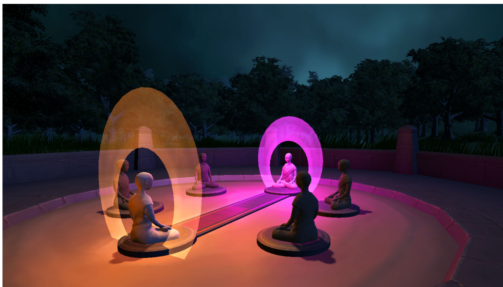
Figure 1. Overview of the scene elements and dyadic visualizations.

Compassion meditation often includes more than one target for the empathic feelings evoked during the exercise. Even though our focus is on dyadic interaction, this broader perspective was included in the design by having four passive statues sitting next to the two active ones connected by the bridge hinting at the possibility of a group setting.