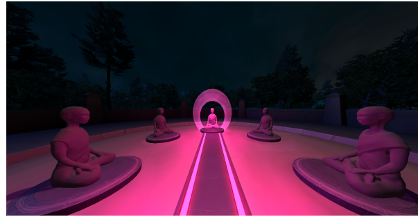
Figure 3. Glow cue in the bridge recesses for a synchronous EEG-state.

Algorithms calculating visualizations are designed to adapt to the participants throughout the subsessions. Individual minimum and maximum values of the monitored biosignals are tracked during the session and