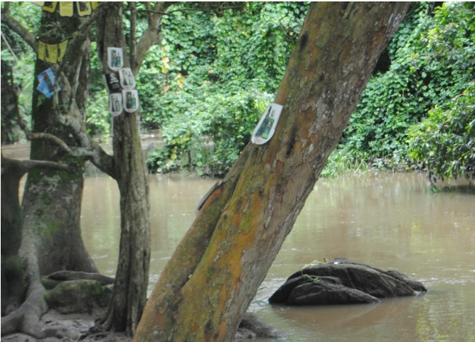
Plate 1: Osun River