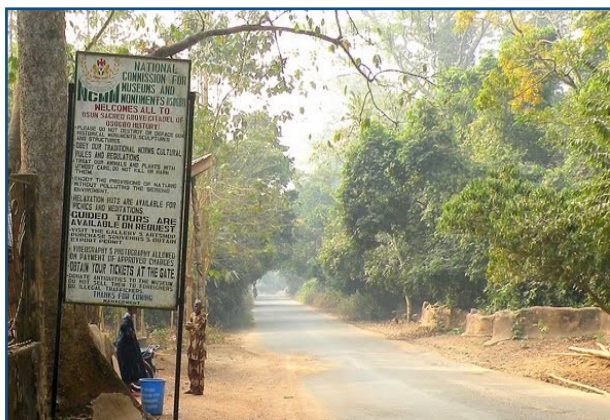
Plate 3: Tarred and Untarred Roads Leading to the Osun Oshogbo Grove