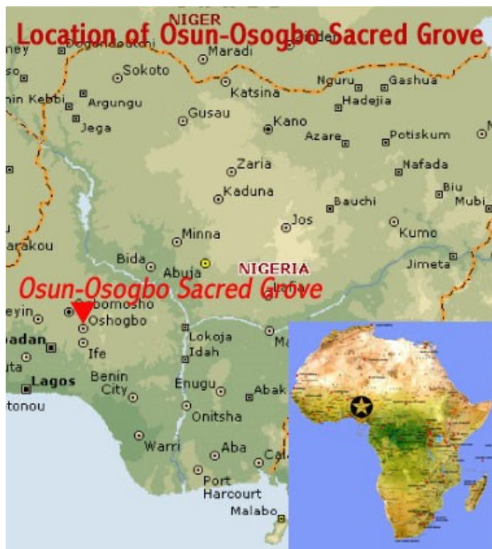
Figure 2: Osun Osogbo Neighbouring Towns / Routes