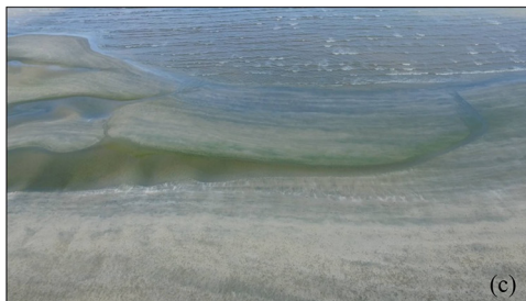
Figure 3. Morphology of BA beach using drone

Notes: (a) Sand bar morphology along with rip channel; (b) sand bar at low tide level north view; (c) sand bar during low tide east view