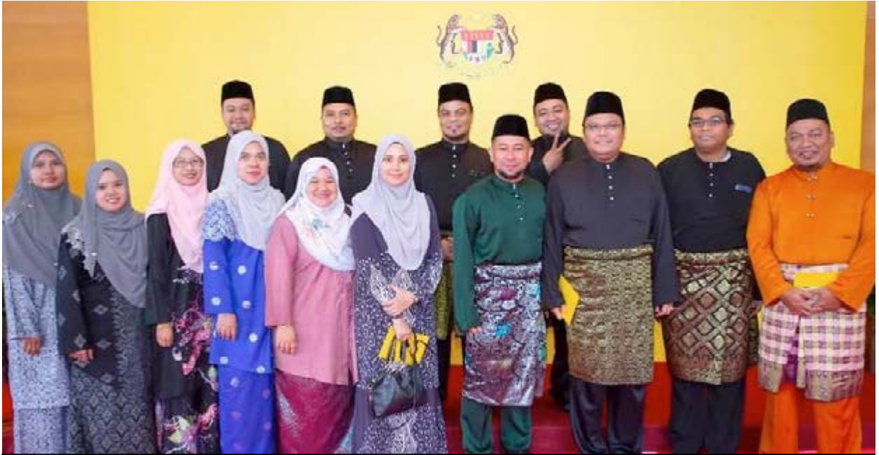
Majlis Penyampaian Watikah Ahli Majlis Agama Islam Negeri Pulau Pinang & Watikah Pelantikan Hakim Mahkamah Syariah Negeri Pulau Pinang