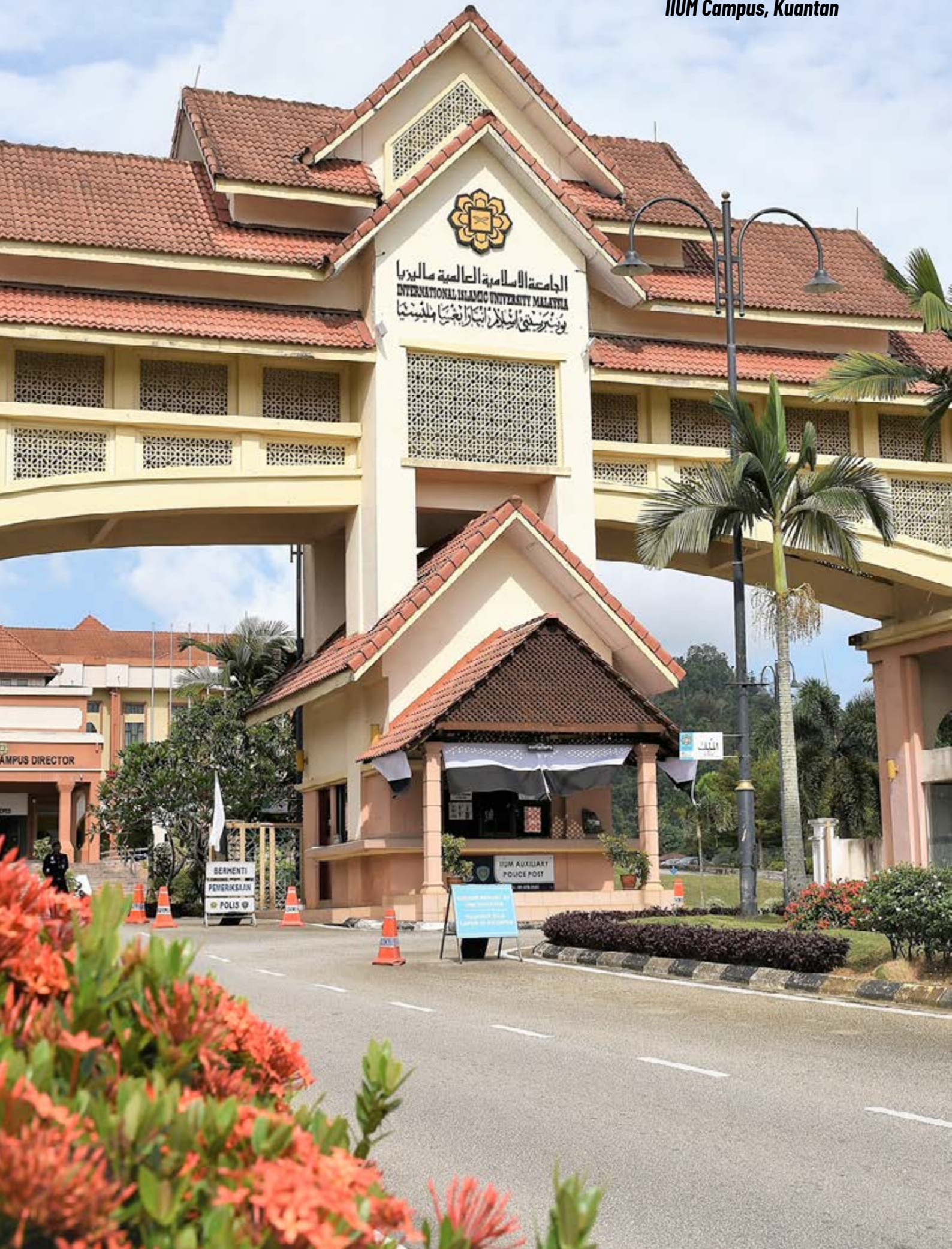
IIUM Campus, Kuantan