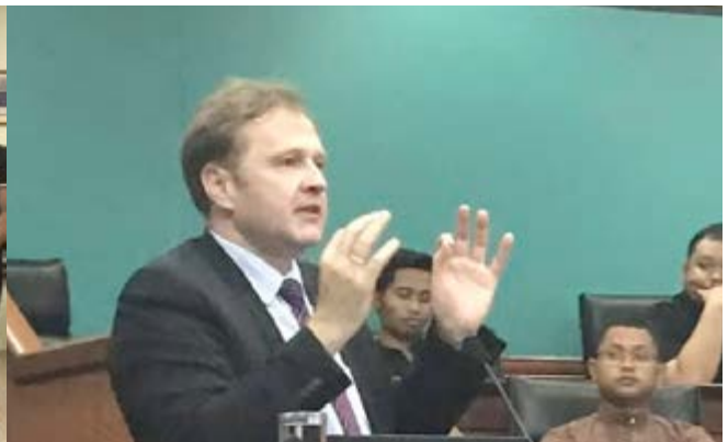
The Inaugural Alumni Lecture Series