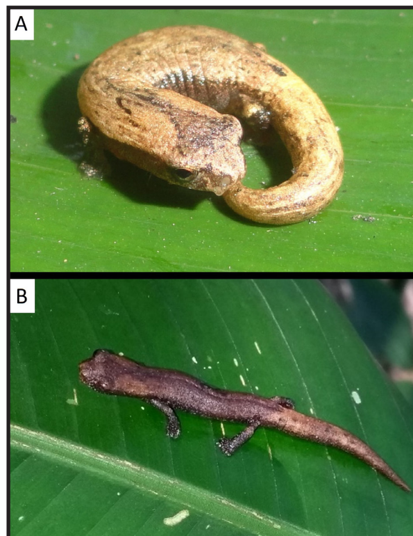
Figure 2. Adults of Bolitoglossa rufescens with typical color patterns of light brown (A) and dark brown tones (B), both observed in the “Altas Montañas” region from central-western Veracruz, Mexico.